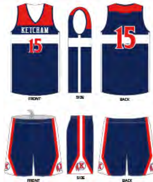
# 4092 - KETCHAM BASKETBALL - SUB 10156, SUB 10132