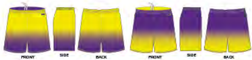
FRONT SIDE BACK FRONT SIDE BACK