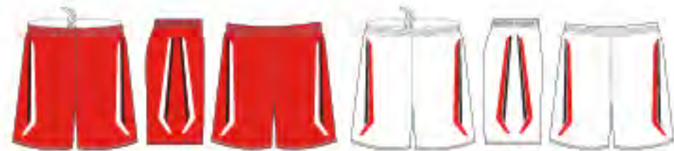
FRONT SIDE BACK FRONT SIDE BACK