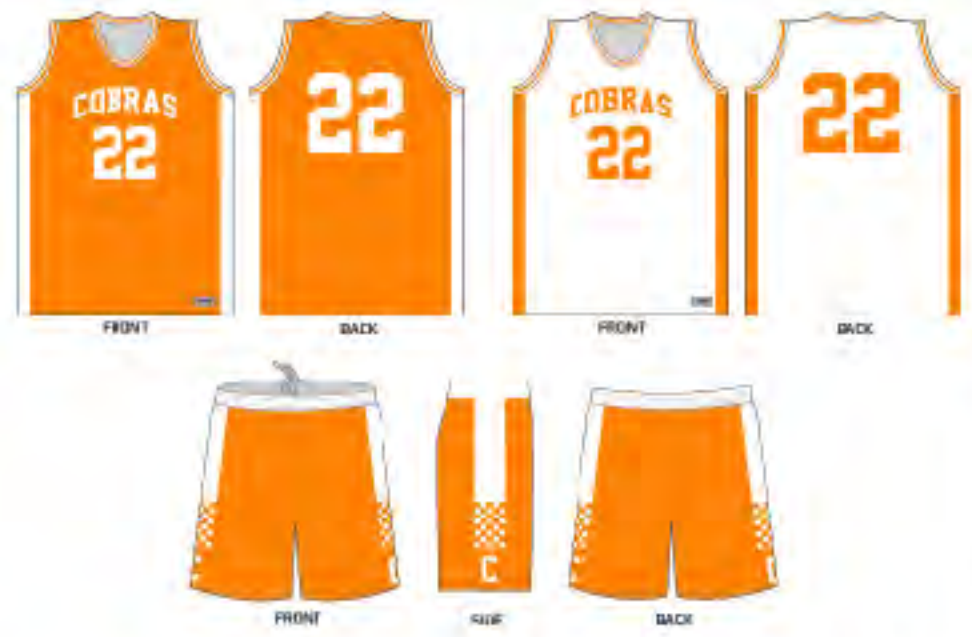
# 10512 - COBRAS BASKETBALL- SUB 50155, SUB 10148