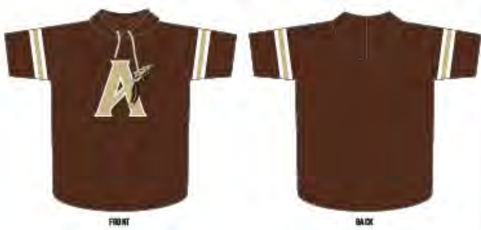
# 15841 - ABSEGAMI BOYS BASKETBALL WARMUP - SUB 10125