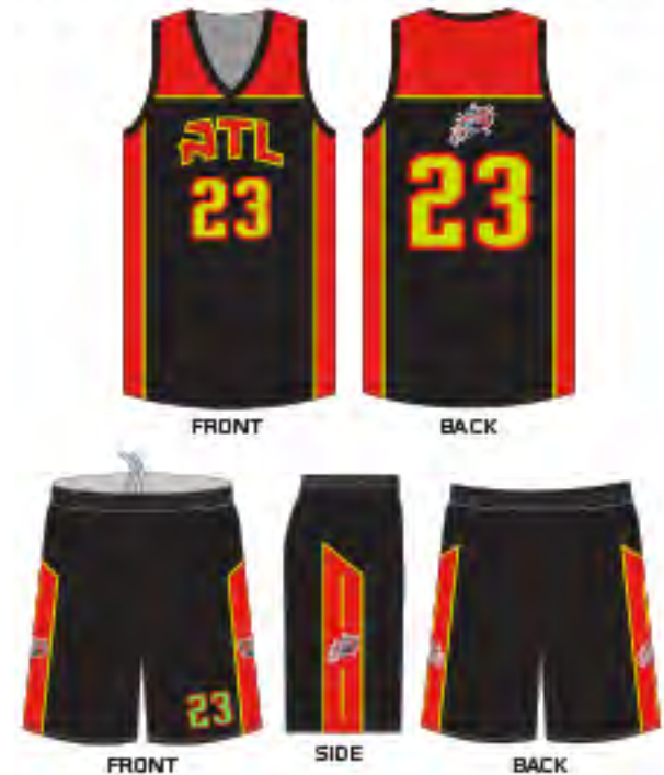
# 3086 - ATL BASKETBALL - SUB 10156, SUB 10132