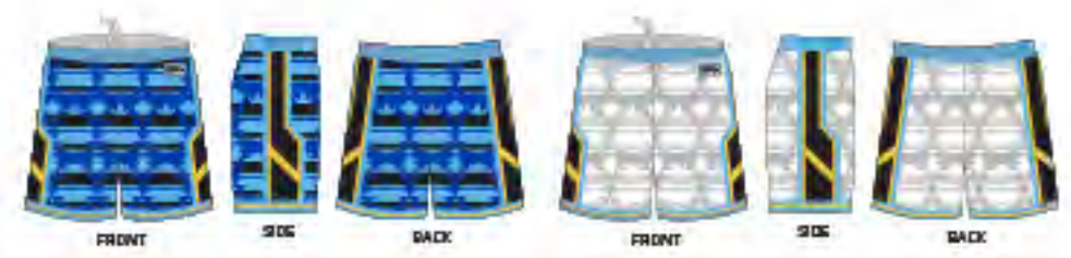
# 12322 - CUMBERLAND BASKETBALL 2 - SUB 50155, SUB 50148