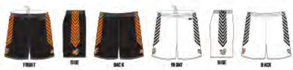
# 14489 - GREENFIELD MS BASKETBALL - SUB 50155, SUB 50130