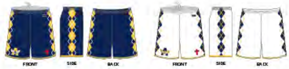
# 11781 - GILMANTON BASKETBALL - SUB 50155, SUB 50130