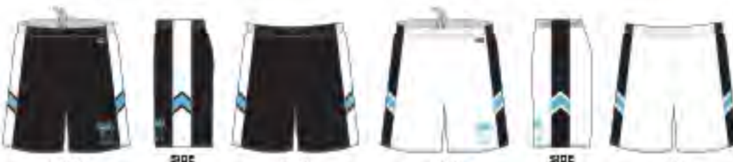
FRONT SIDE BACK FRONT SIDE BACK