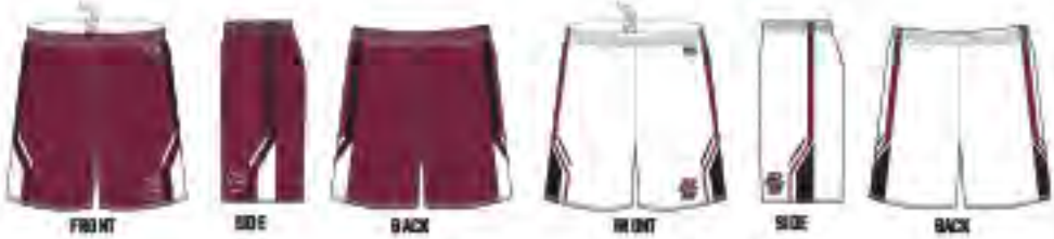
# 16071 - POTTSGROVE FRESHMAN BASKETBALL UNIFORM - SUB 50155, SUB 50132