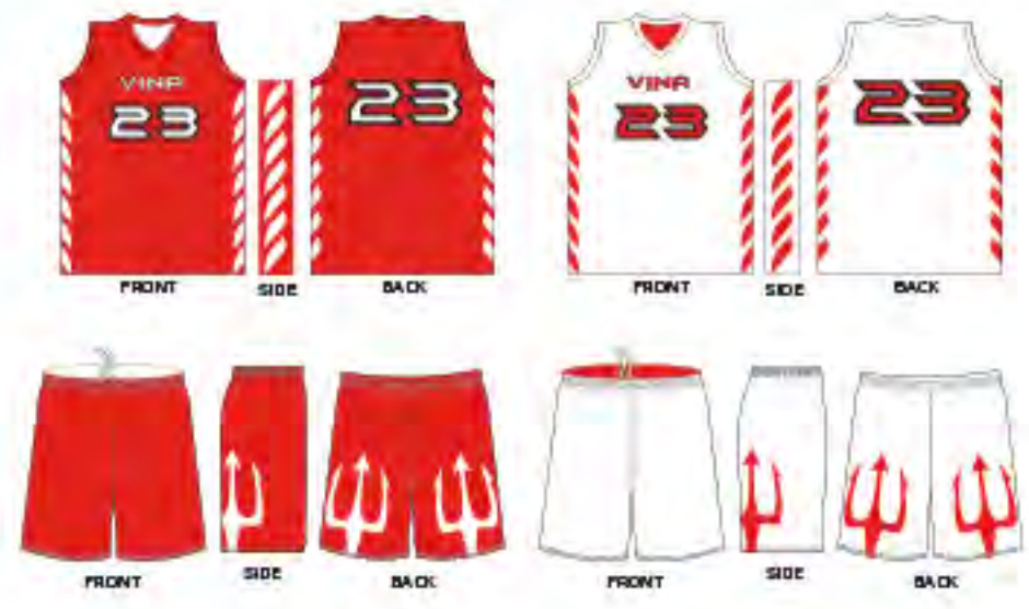
# 12178 - VINA BASKETBALL - SUB 50155, SUB 50148