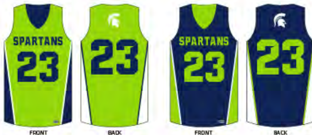
# 4740 - SPARTANS - SUB 50155