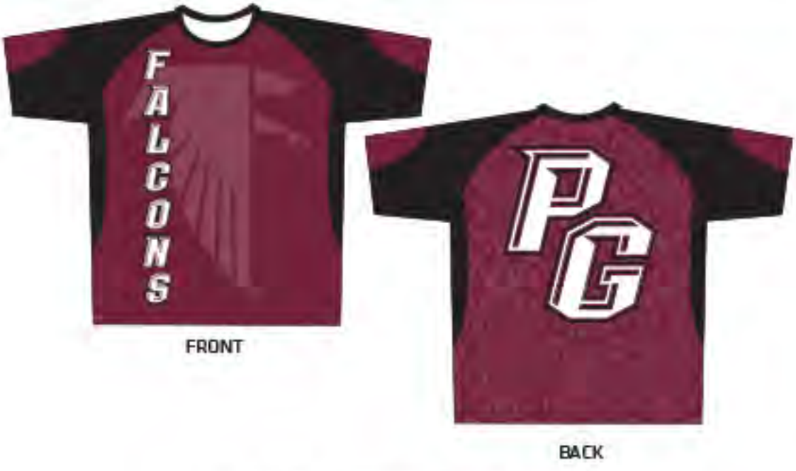
# 855- POTTSGROVE - SUB 10101