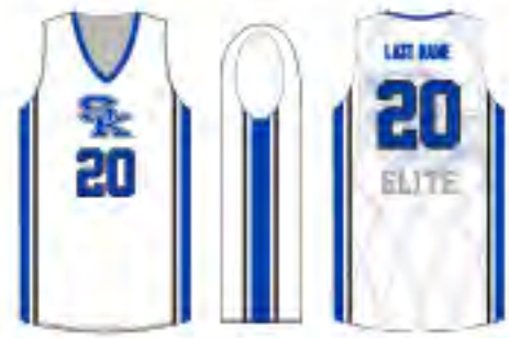
FRONT SIDE BACK