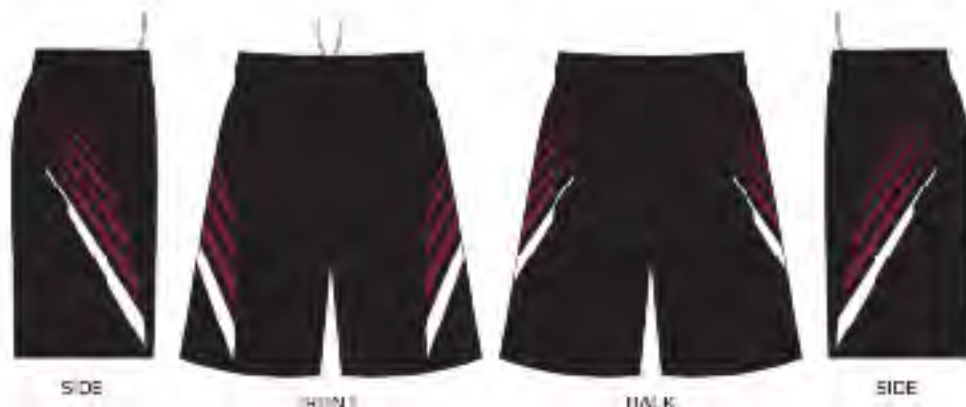
# 10559 - MILWAUKEE - SUB 10149