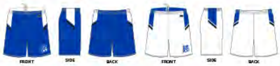
# 13492 - BELMONT MS UNIFIED BASKETBALL - SUB 50155, SUB 50132