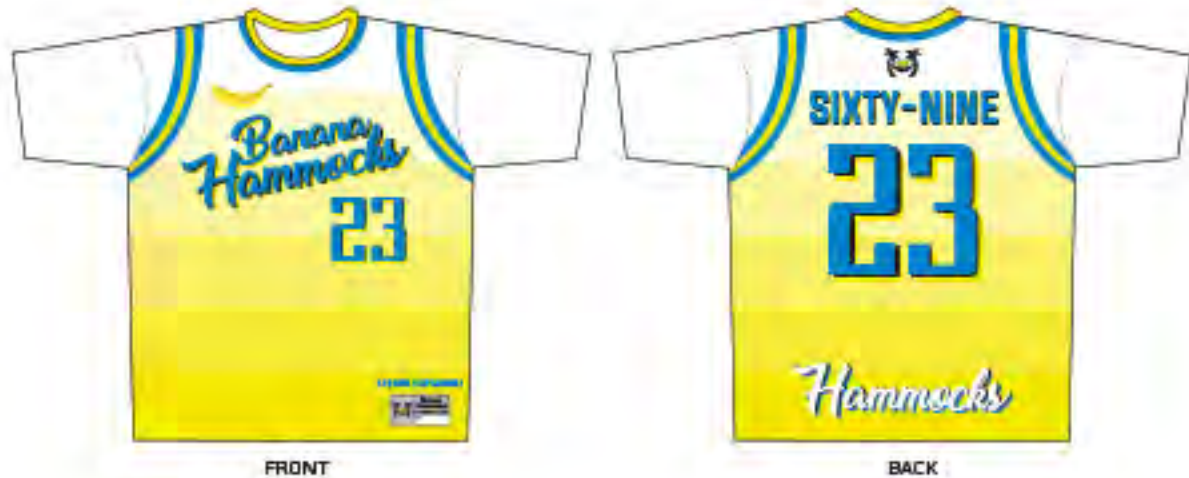
# 4443 - BANANA HAMMOCKS - SUB 10101