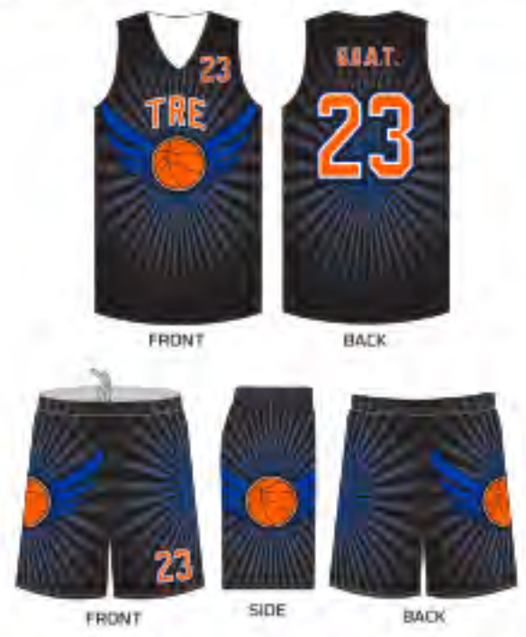
# 3252 - TRE BASKETBALL - SUB 10156, SUB 10132