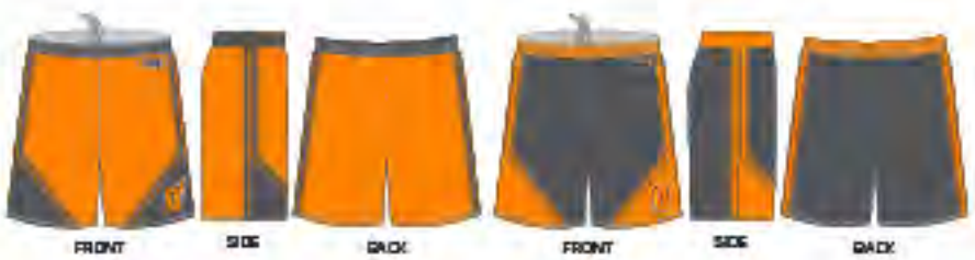
# 11293 - BANKSHOT ONEIDA HS BASKETBALL - SUB 50155, SUB 50149