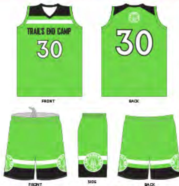
# 4521 - TRAIL'S END CAMP #1 - SUB 10156, SUB 10132