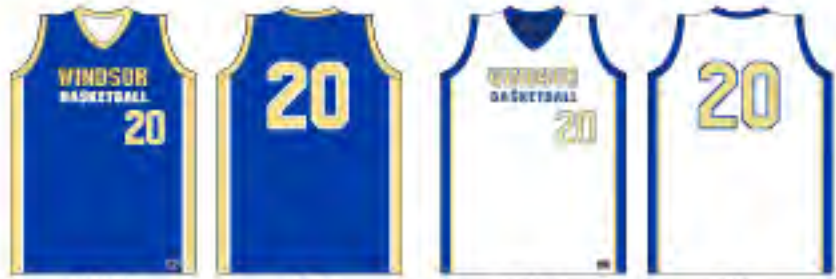
FRONT BACK FRONT BACK