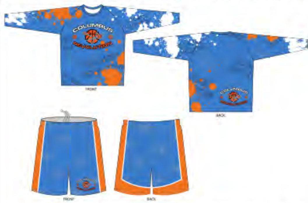
# 23 - COLUMBUS REVOLUTION - SUB 10187, SUB 10132