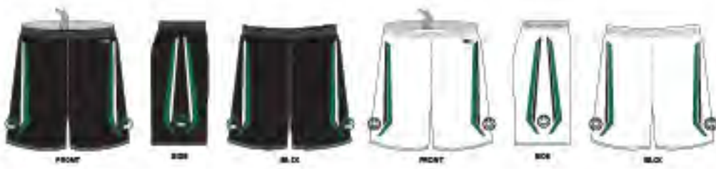
# 11590 - TERRIERS BASKETBALL - SUB 50155, SUB 50148