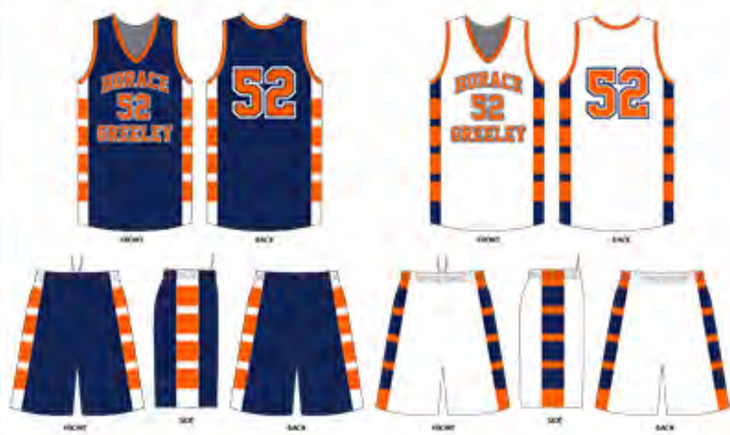
# 2772 - HORACE GREELEY BOY'S BASKETBALL - SUB 50155, SUB 10149