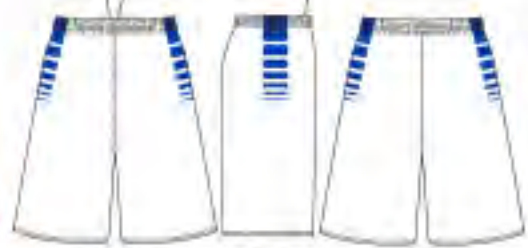
FRONT SIDE BACK