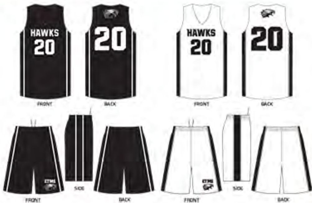
# 918 - CTMS HAWKS - SUB 50155, SUB 10149