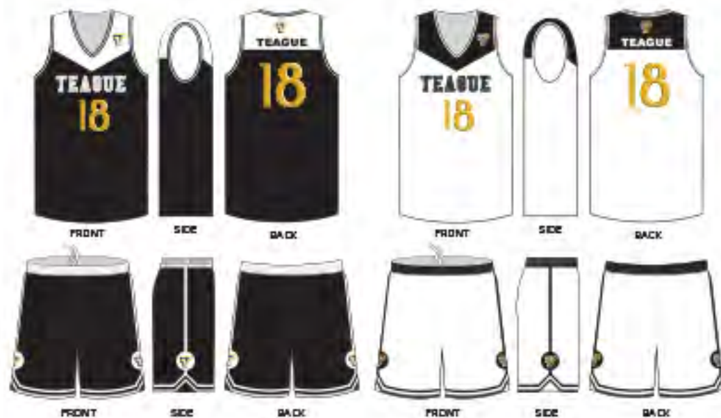
# 4072 - TEAGUE - SUB 10156, SUB 10132