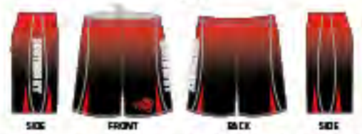
SIDE FRONT BACK SIDE