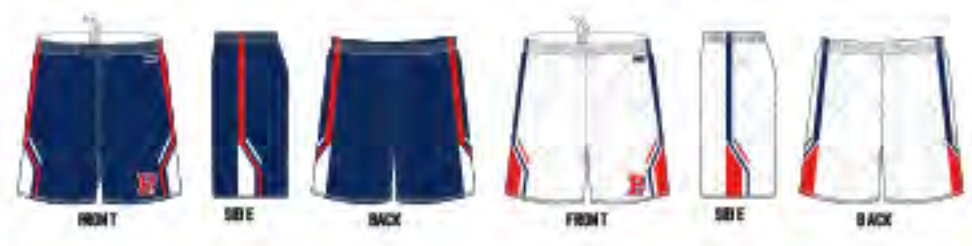
# 15742 - U OF A WHEELCHAIR BASKETBALL - SUB 50155, SUB 50148