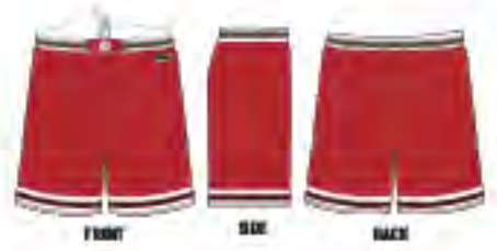
# 13455 - CONCORD HS BASKETBALL - SUB 50155, SUB 50148