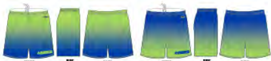
FRONT SIDE BACK FRONT SIDE BACK