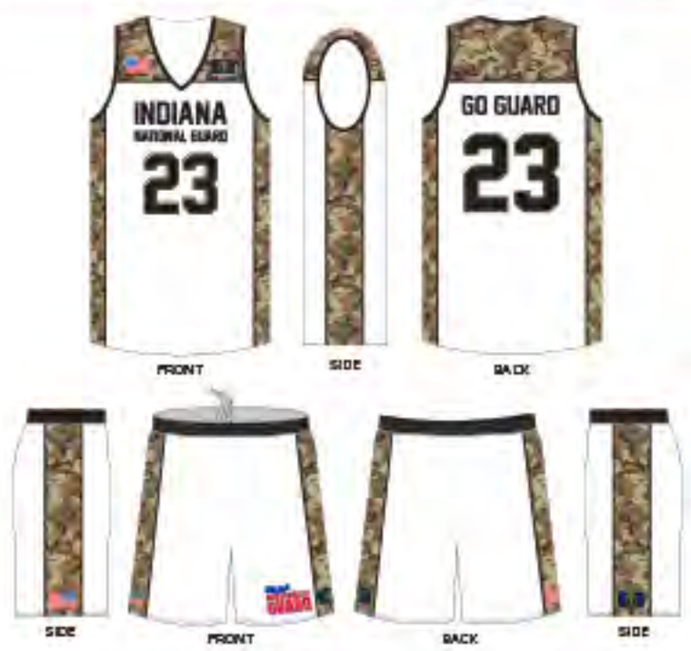
# 4124- INDIANA NATIONAL GUARD - SUB 10156, SUB 10132