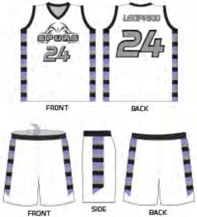
# 4297 - SPURS - SUB 10156, SUB 10132