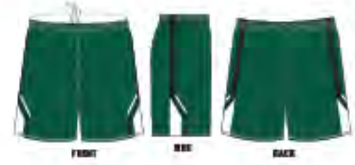
# 15724 - WANATAH SCHOOL BOYS BASKETBALL - SUB 50155, SUB 10130