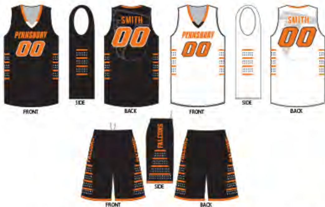
# 362 - PENNSBURY BASKETBALL- SUB 10155, SUB 10149