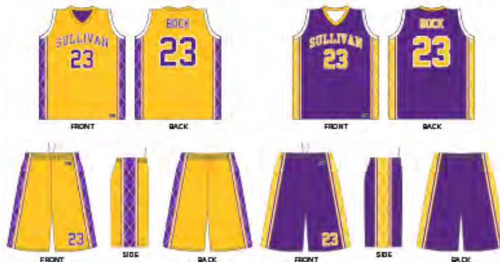
# 5255 - SULLIVAN BASKETBALL - SUB 50155, SUB 50149