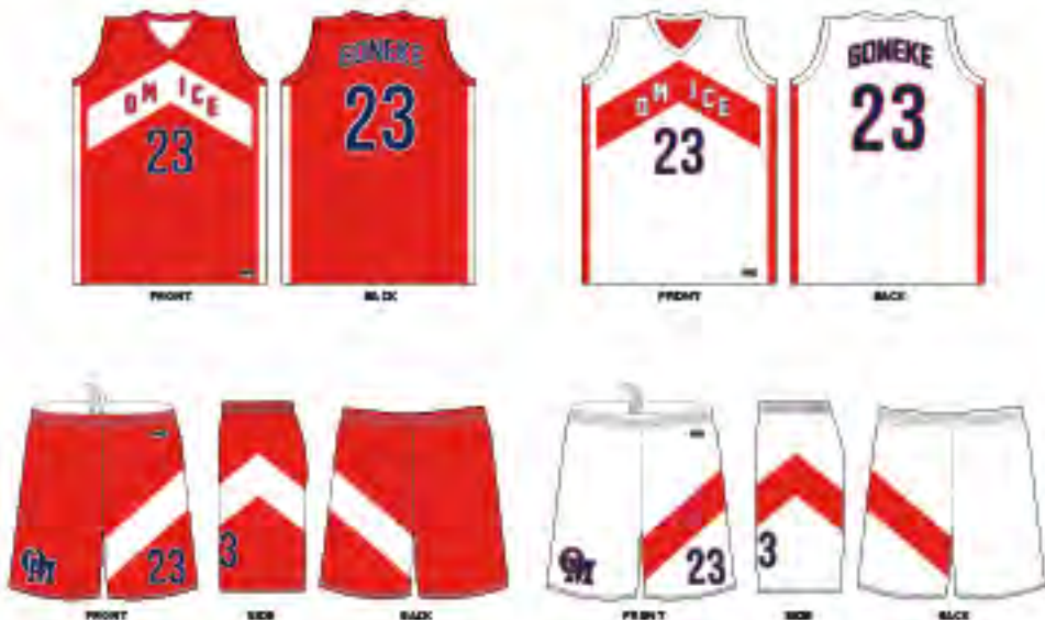
# 12324 - OAK MTN. BASKETBALL- SUB 50155, SUB 50130