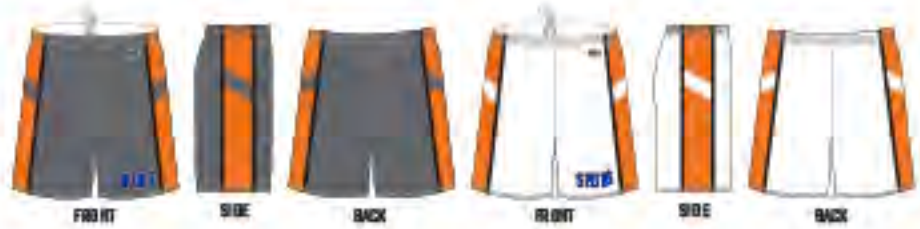
# 13029 - RIDGEFIELD HS BASKETBALL - SUB 50155, SUB 50132