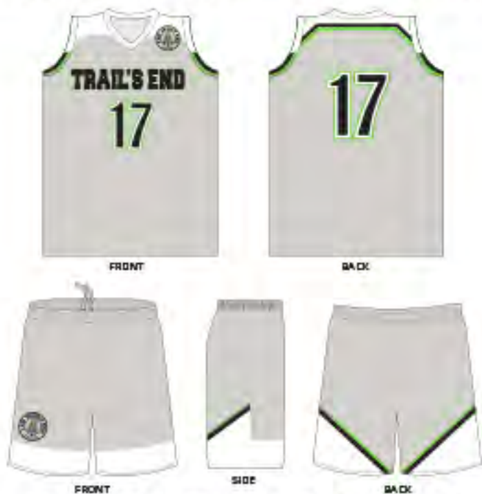
# 4521 - TRAIL'S END CAMP #2 - SUB 10156, SUB 10132