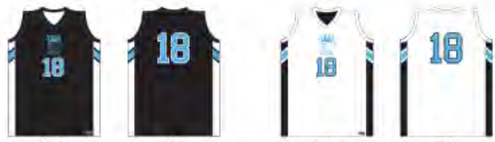
FRONT BACK FRONT BACK