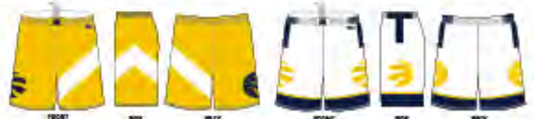
FRONT SIDE BACK FRONT SIDE BACK