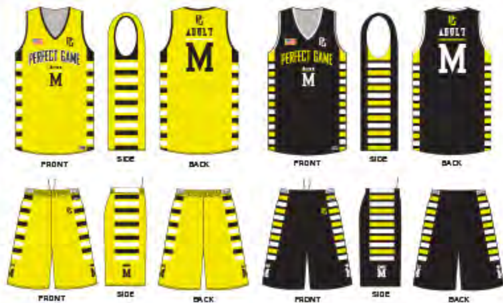
# 4100 - PERFECT GAME SAMPLES - SUB 50155, SUB 10149