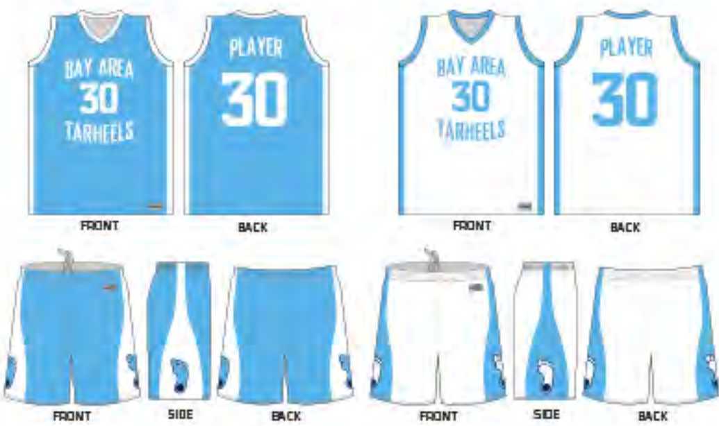
# 4602 - BAY AREA TARHEELS - SUB 50155, SUB 50132