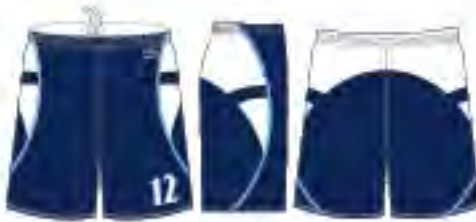
FRONT SIDE BACK