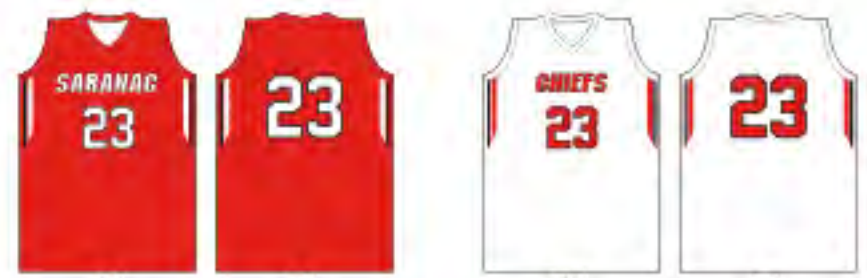
FRONT BACK FRONT BACK