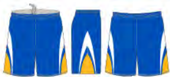
FRONT SIDE BACK