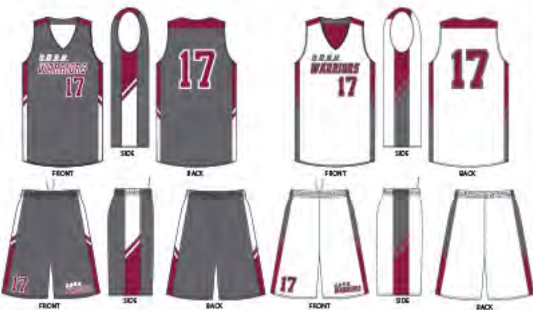
# 250 - GOSH WARRIORS - SUB 50155, SUB 10149