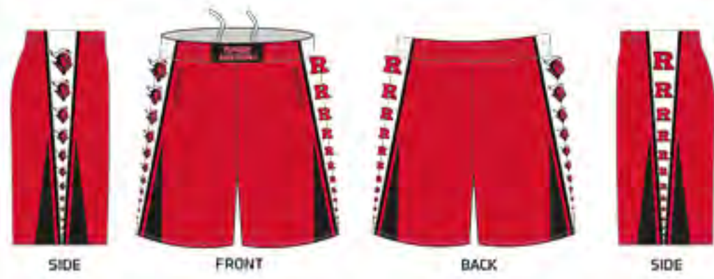
# 2717 - RUTGERS DESIGN 2 - SUB 10197