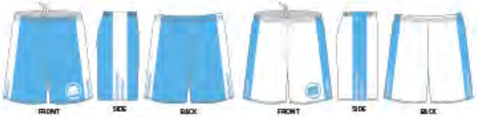
FRONT SIDE BACK FRONT SIDE BACK