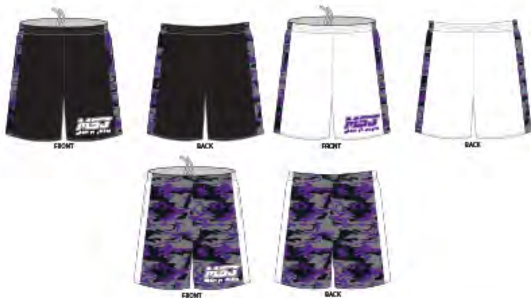
# 209 - MOUNT ST. JOSEPH SHORTS - SUB 10132