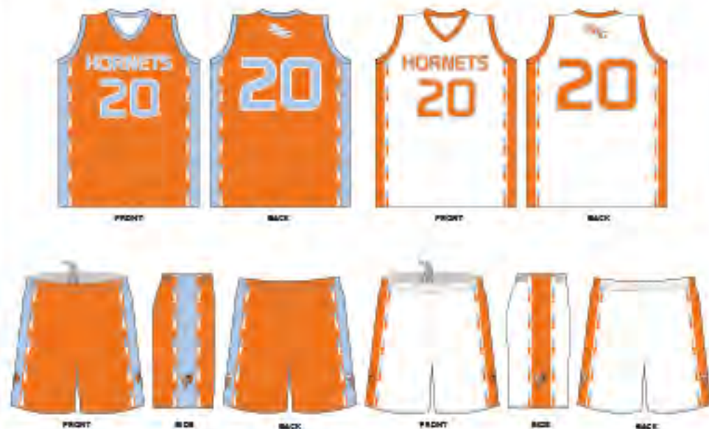
# 5177 - MEDINA MS BOYS 7TH & 8TH - SUB 10156, SUB 10132