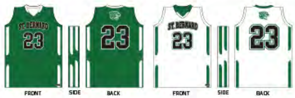
FRONT SIDE BACK FRONT SIDE BACK FRONT SIDE BACK