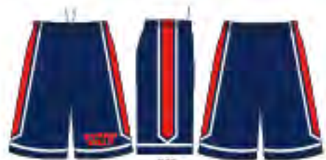
FRONT SIDE BACK