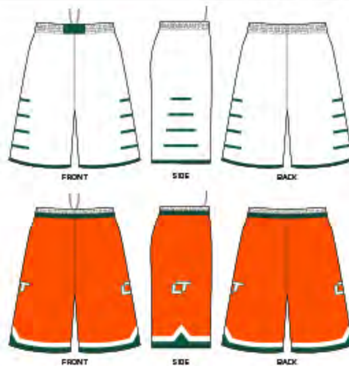
# 5217 - COACHES CORNER SHORTS - SUB 10149