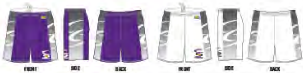
# 16002 - STEM CIVICS BOYS BASKETBALL - SUB 50155, SUB 50130