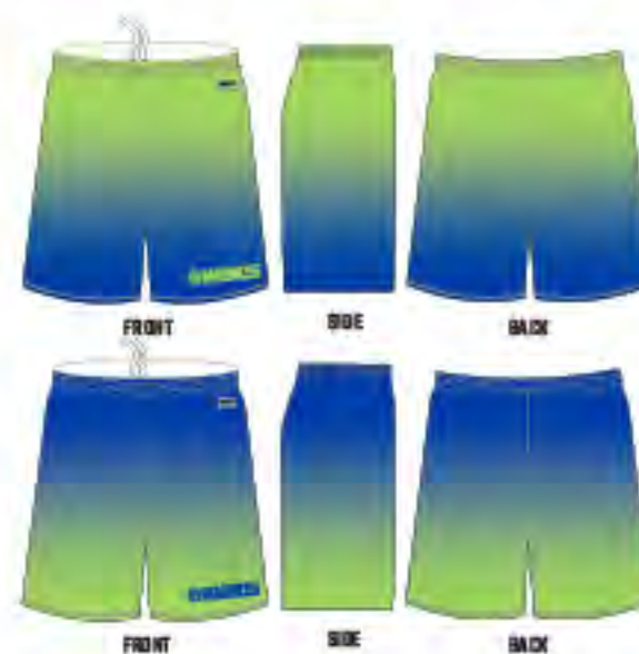
# 16054 - AYS MADNESS BASKETBALL SHORTS - SUB 50148