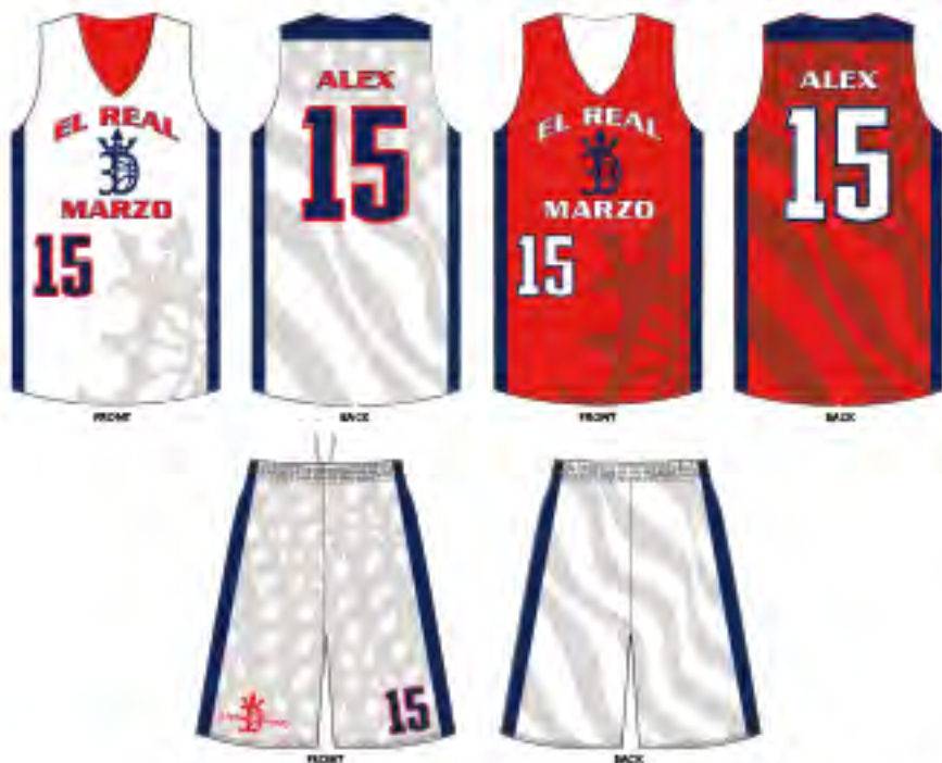
# 384 - EL REAL 3DM - SUB 10156, SUB 10149