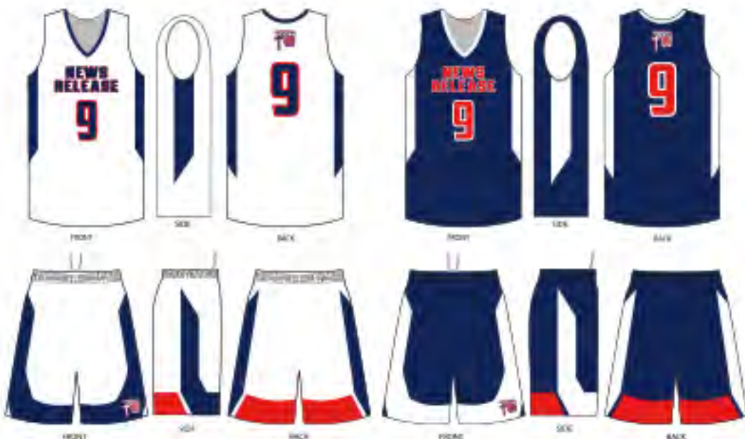
# 3158 - NEWS RELEASE - SUB 50155, SUB 50149