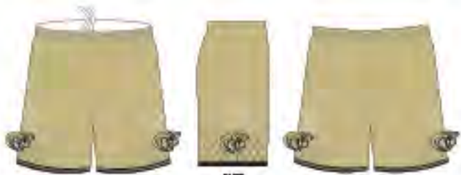
FRONT SIDE BACK