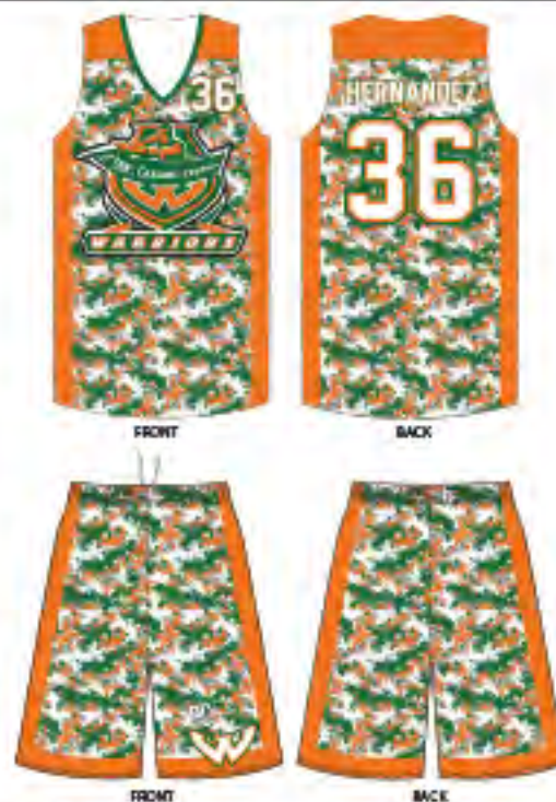
# 461 - ARREGLOS WARRIORS - SUB 10156, SUB 10149