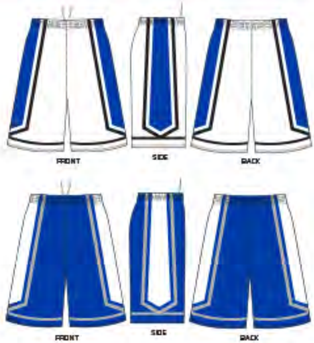
# 5090 - BELGREEN BOOSTERS - SUB 10149