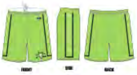
# 15358 - MR. BASKETBALL ACADEMY #2 - SUB 50155, SUB 50148