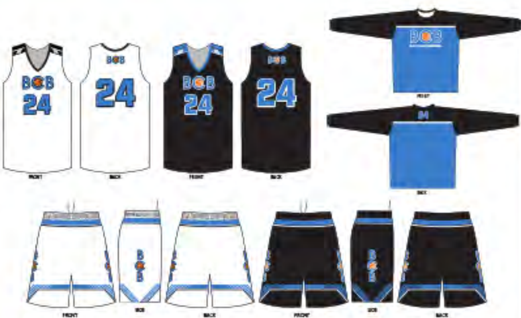
# 3135 - BCB BASKETBALL - SUB 50155, SUB 50149, SUB 10187