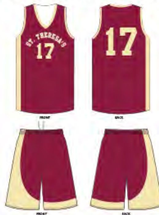
# 385 - ST. THERESA'S BASKETBALL - SUB 10156, SUB 10149