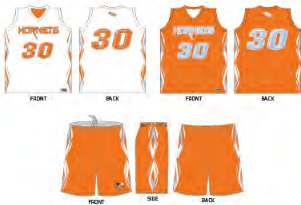
# 5018 - MEDINA MS BOYS - SUB 50155, SUB 10132