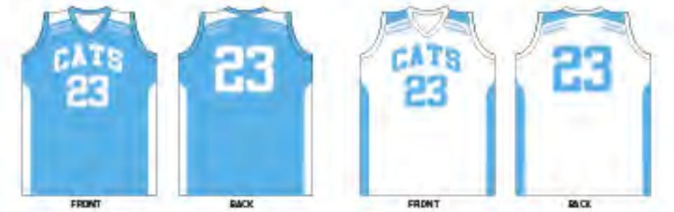
FRONT BACK FRONT BACK