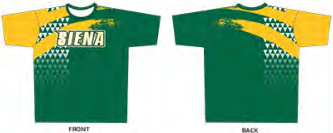
# 2853 - SIENA BASKETBALL - SUB 10101