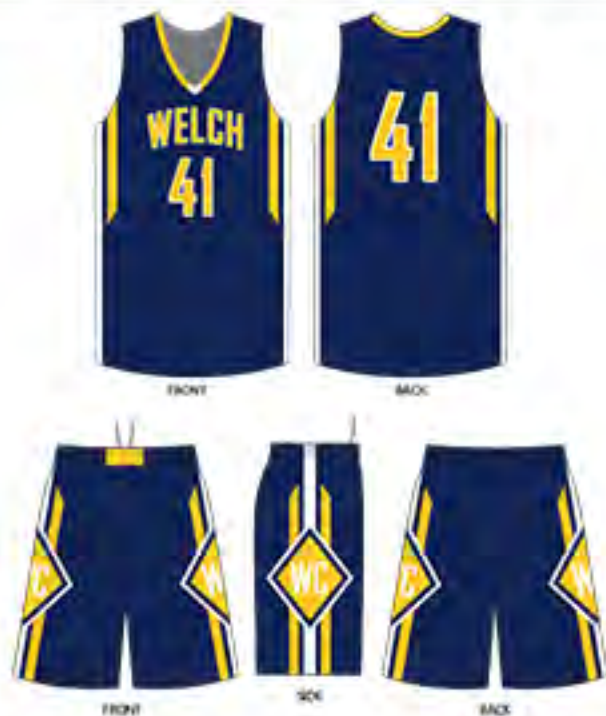
# 2807 - WELCH BASKETBALL - SUB 10156, SUB 10149