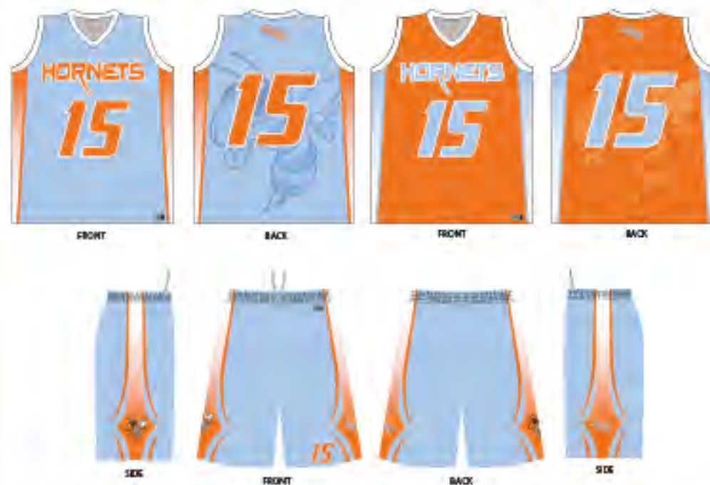
# 4591 - HORNETS MIDDLE SCHOOL - SUB 50155, SUB 10149