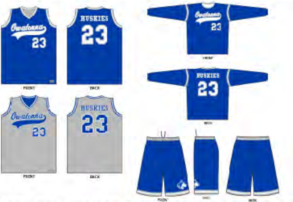
# 10533 - OWATONNA BASKETBALL - SUB 50155, SUB 10149, SUB 10187