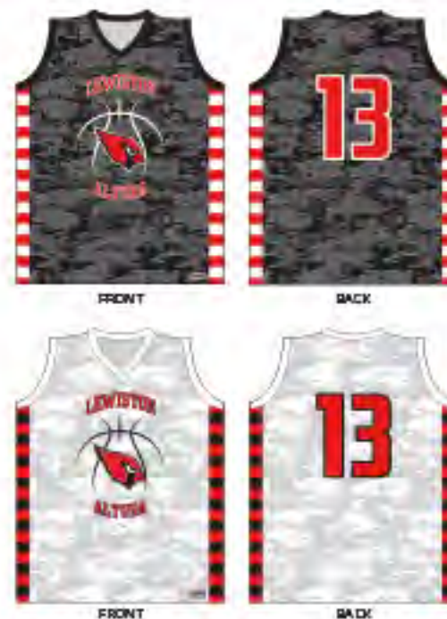
# 5071 - LEWISTON-ALTURA - SUB 50155