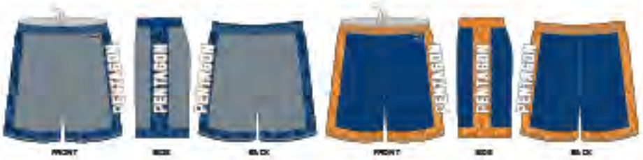
# 12037 - PENTAGON BASKETBALL- SUB 50155, SUB 50130