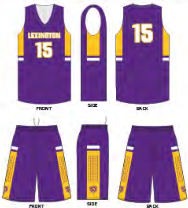
# 4042 - LEXINGTON - SUB 10156, SUB 10149