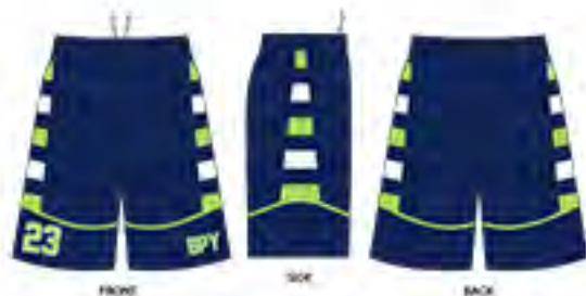
# 2877 - BPY BASKETBALL - SUB 50155, SUB 10132