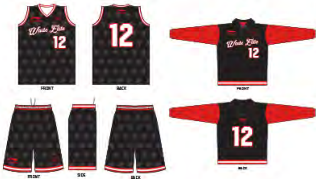
# 4286 - WADE ELITE - SUB 10156, SUB 10149, SUB 10125