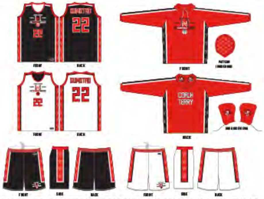
# 13255 - MR. BASKETBALL ACADEMY - SUB 50155, SUB 50130, SUB 10125