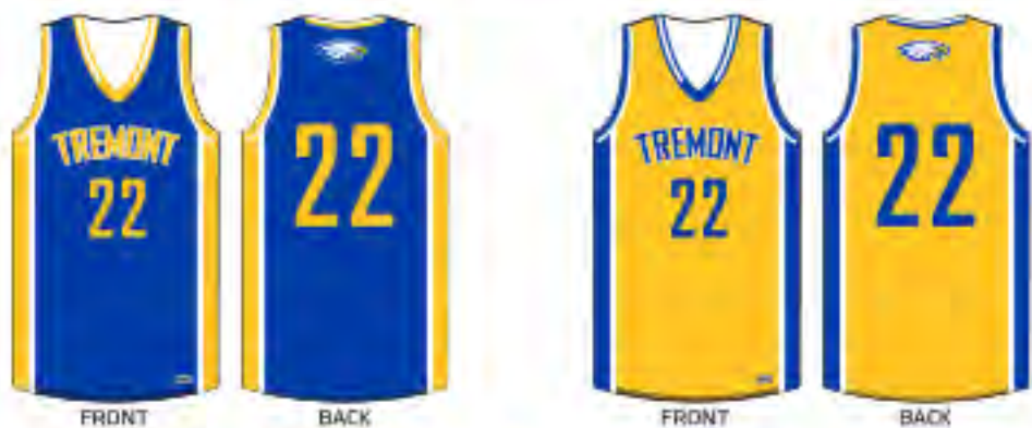
FRONT BACK FRONT BACK