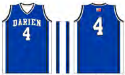
FRONT SIDE BACK