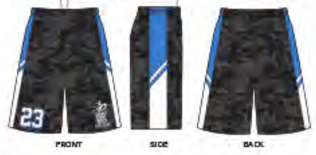
# 736 - 3D - SUB 50155, SUB 10149