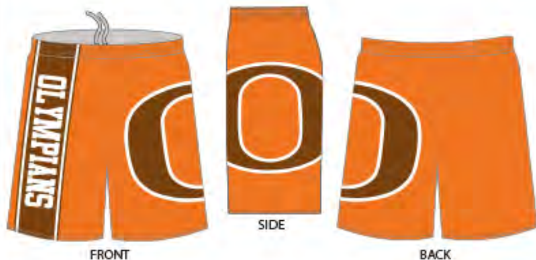
# 349 - OLYMPIANS - SUB 10132