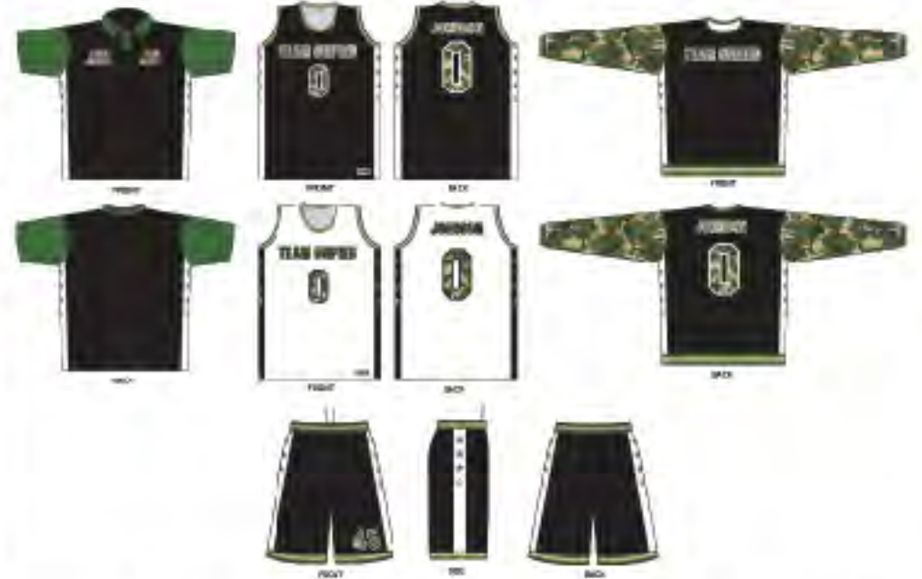
# 10553 - TEAM UNIFIED - SUB 10109, SUB 50155, SUB 10187, SUB 10148