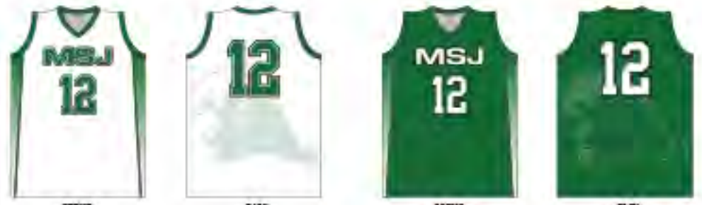
FRONT BACK FRONT BACK