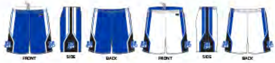
# 13461 - BELMONT BOYS BASKETBALL - SUB 50155, SUB 50148