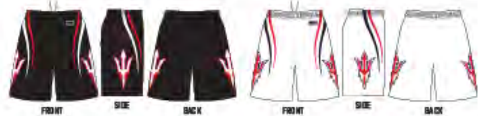
# 16009 - BIG SANDY GIRLS BASKETBALL - SUB 50155, SUB 50148