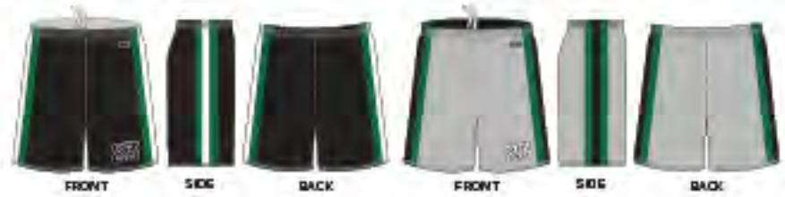
# 11963 - BOISE SLAM BASKETBALL - SUB 50155, SUB 50232