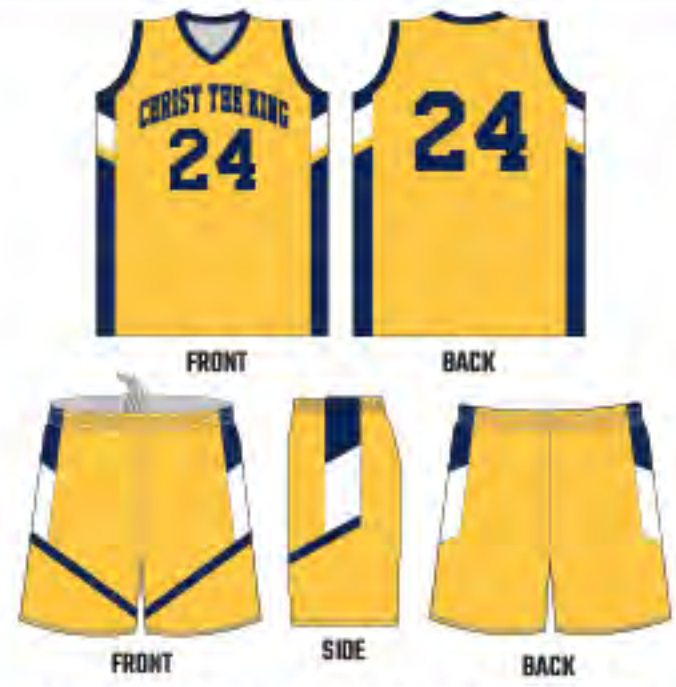
# 12807 - CHRIST THE KING BASKETBALL - SUB 10156, SUB 10130