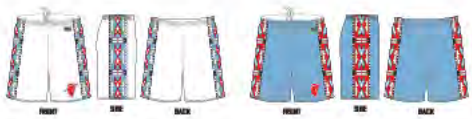
# 14212 - WYOMING BASKETBALL - SUB 50155, SUB 50130