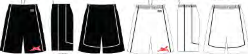
FRONT SIDE BACK FRONT SIDE BACK