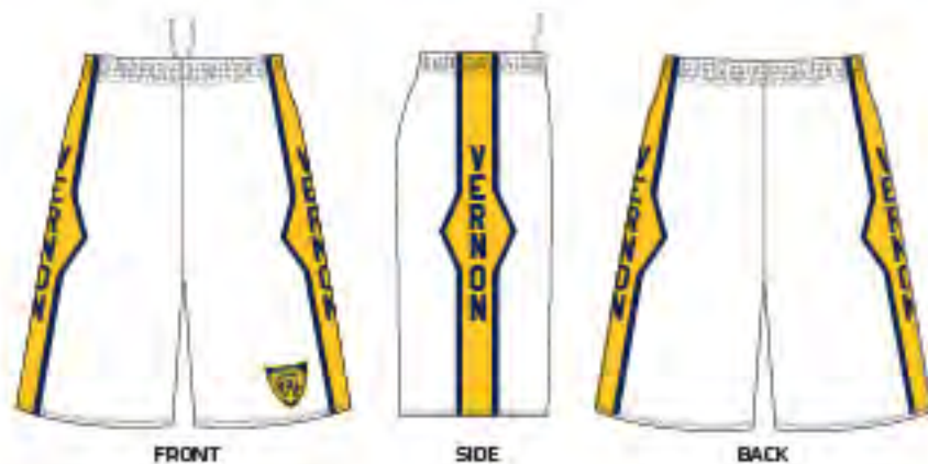
# 12524 - VERNON PAL BASKETBALL SHORTS - SUB 10148