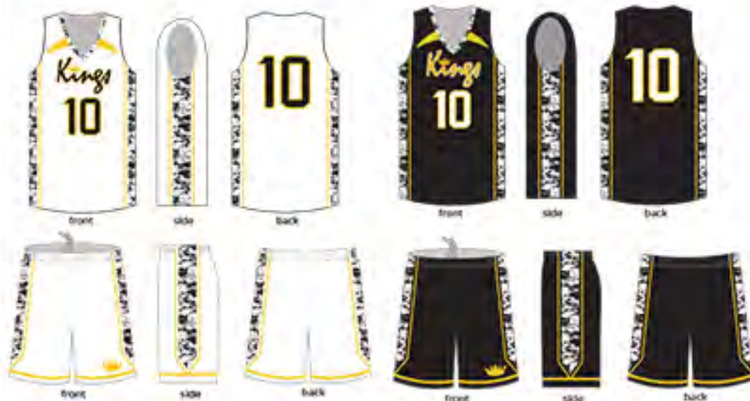
# 2262 - TAMPA KINGS - SUB 10156, SUB 10149