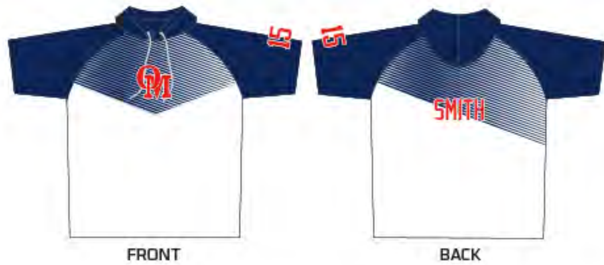
# 12367 - OM BASKETBALL - SUB 10125 SS