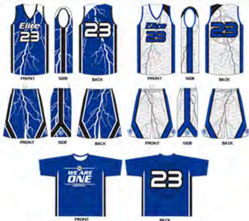
# 1062 - ELITE BASKETBALL - SUB 10156, SUB 10149, SUB 10101