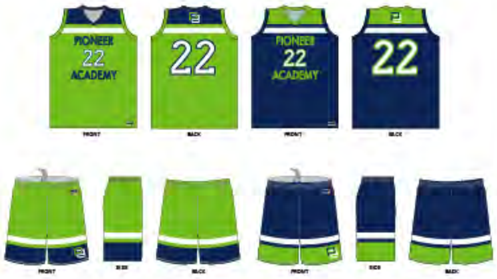
# 12163 - PIONEER ACADEMY BASKETBALL - SUB 50155, SUB 50148