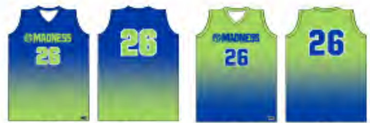
FRONT BACK FRONT BACK