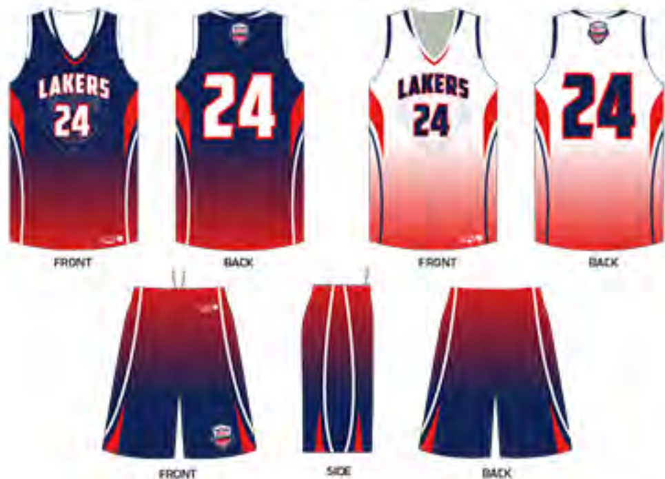
# 934 - LAKERS BASKETBALL - SUB 50155, SUB 10149