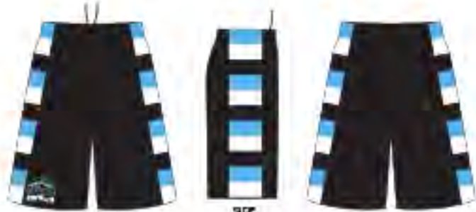
FRONT SIDE BACK