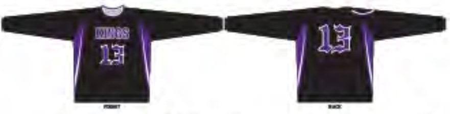
# 4686 - KINGS TEAM 2 - SUB 50155, SUB 10132, SUB 10187