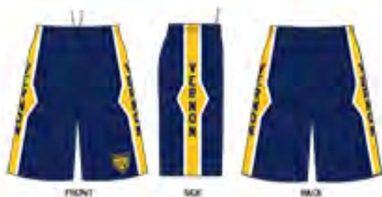
# 2869 - VERNON PAL BASKETBALL - SUB 50155, SUB 50149