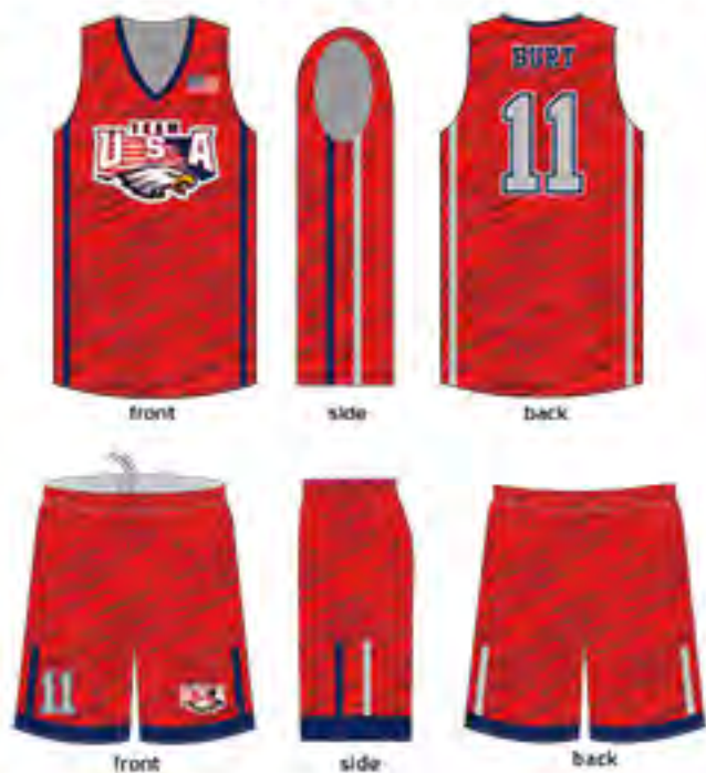
# 2241 - TEAM USA BASKETBALL 2016 - SUB 10156, SUB 10149