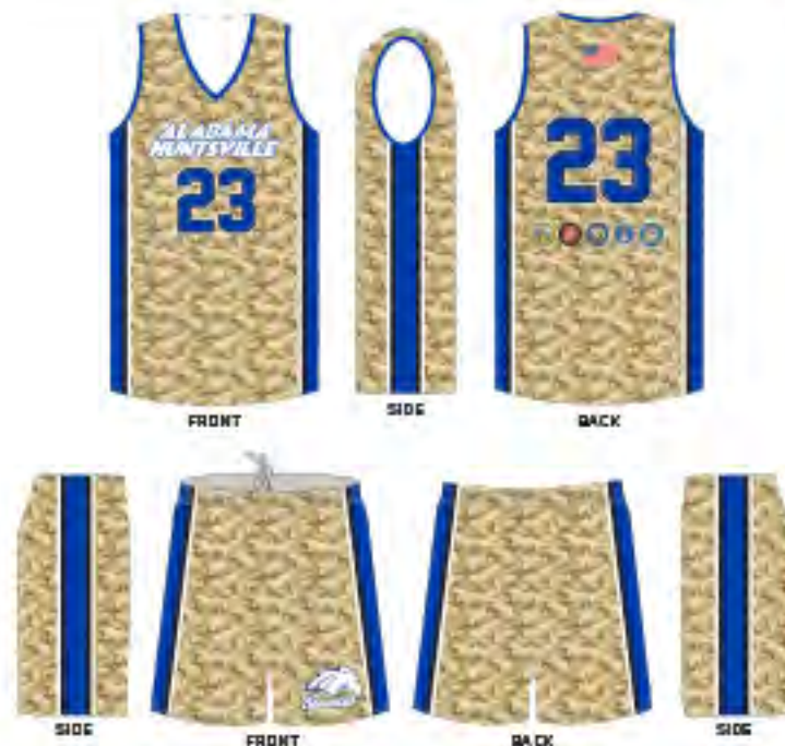
# 4133 - ALABAMA HUNTSVILLE CAMO - SUB 10156, SUB 10132