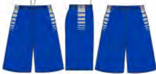
FRONT SIDE BACK