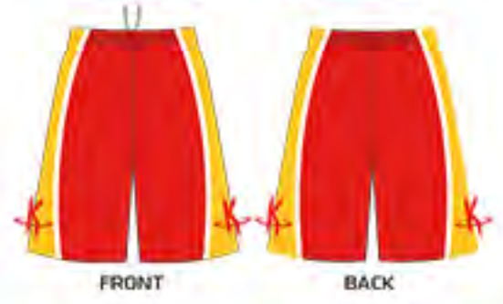
# 701 - KCRIO - SUB 10156, SUB 10149