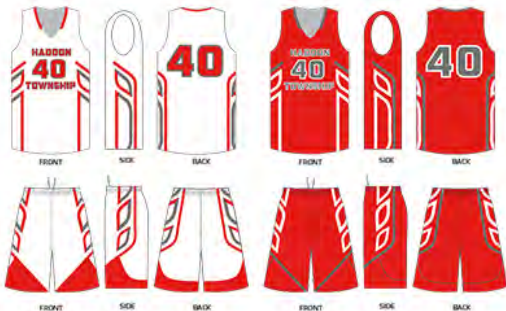
# 949- HADDON BASKETBALL - SUB 10156, SUB 10149