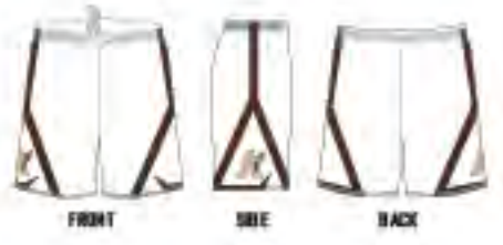
# 15459 - ABSEGAMI BOYS BASKETBALL UNIFORM - SUB 50155, SUB 50148