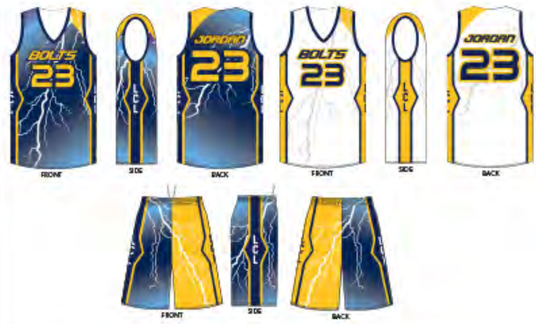
# 241 - BOLTS BASKETBALL - SUB 50155, SUB 10149