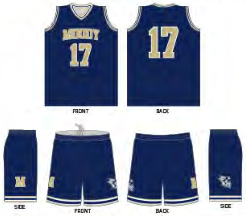
# 4815 - MOODY JR HIGH - SUB 50155, SUB 10132