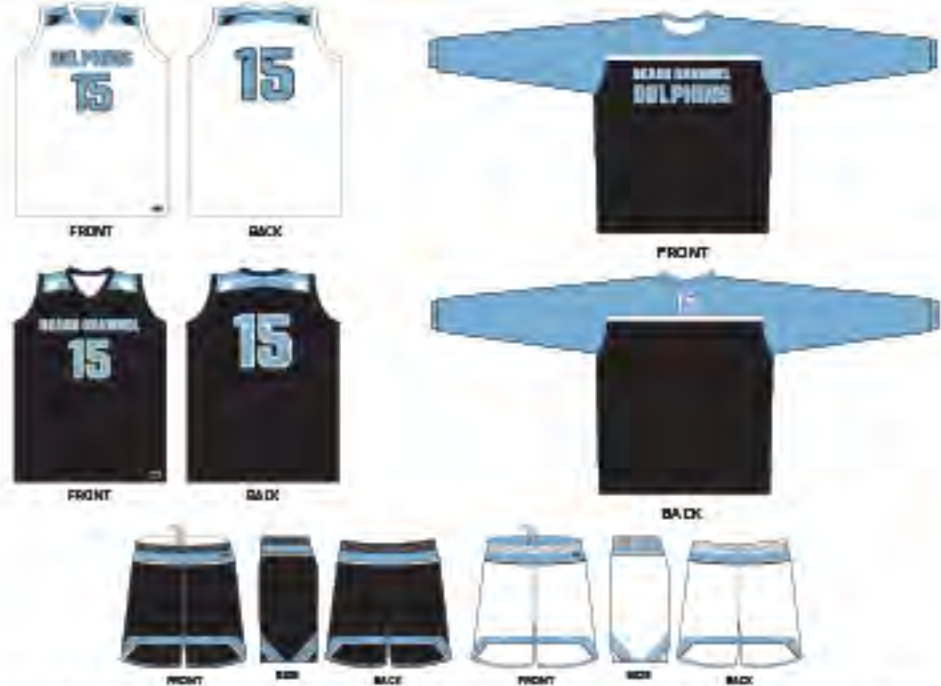
# 12077 - BEACH CHANNEL HS BASKETBALL - SUB 50155, SUB 50148, SUB 10187