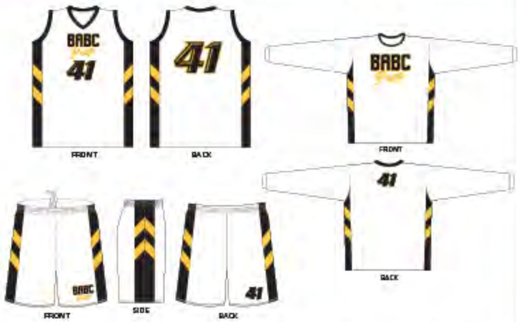
# 12134 - BABC PREP BASKETBALL- SUB 10156, SUB 10148, SUB 10187