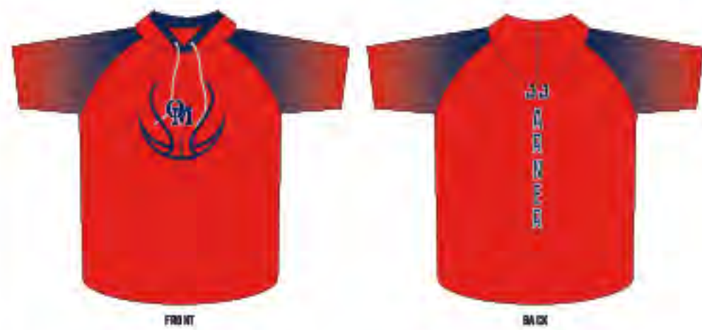
# 16281 - OM RAPTORS BOYS BASKETBALL - SUB 10125