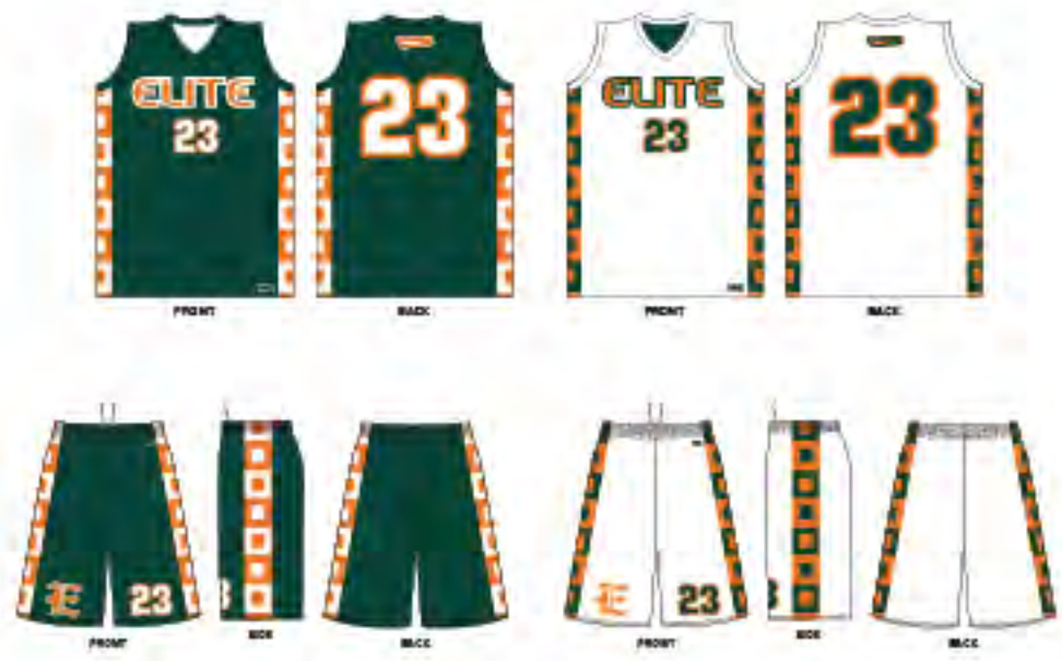
# 12160 - ELITE ELKRIDGE BASKETBALL - SUB 50155, SUB 10148