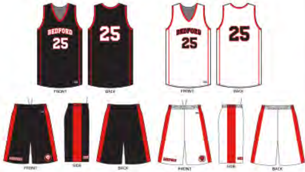
# 3526 - BEDFORD BOYS BASKETBALL - SUB 50155, SUB 50149