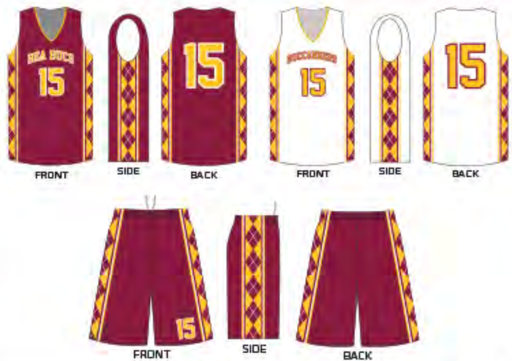
# 3505 - BEA BUCS - SUB 50155, SUB 10149