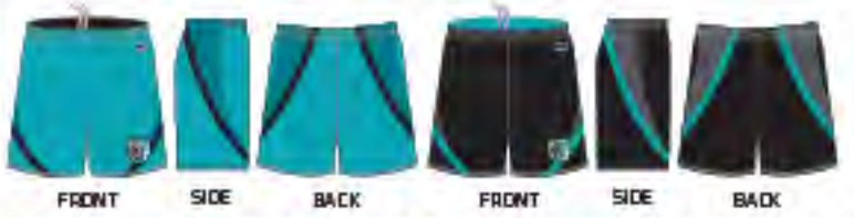
# 12320 - APG BOYS BASKETBALL - SUB 50155, SUB 50130, SUB 80125