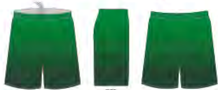
FRONT SIDE BACK