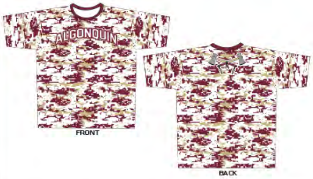
# 2760 - ALGONQUIN - SUB 10101