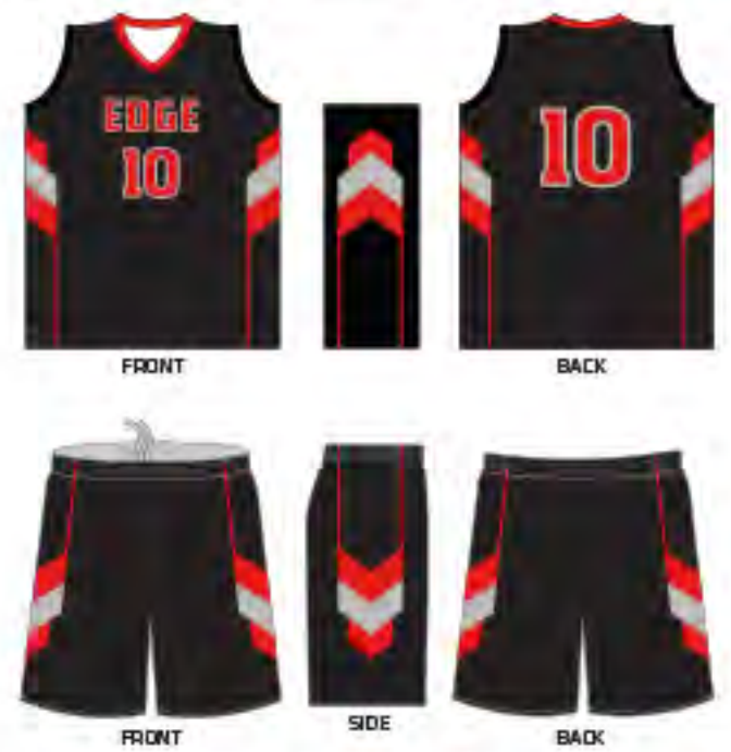
# 4262- EDGE BASKETBALL - SUB 10156, SUB 10132