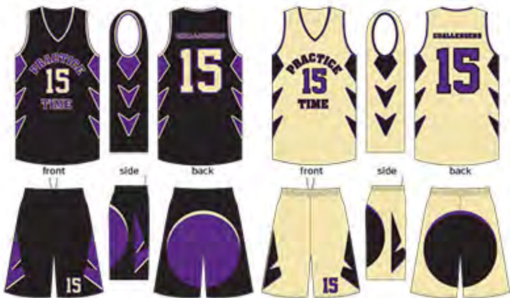
# 555 - PRACTICE TIME- SUB 50155, SUB 50149