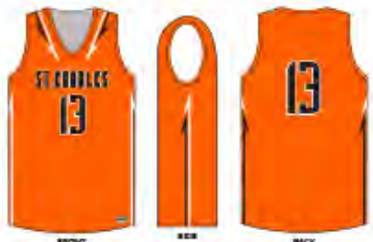
FRONT SIDE BACK