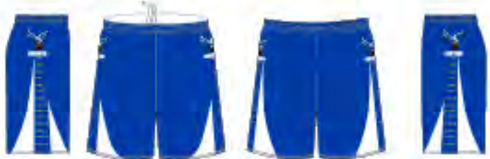
SIDE FRONT BACK SIDE