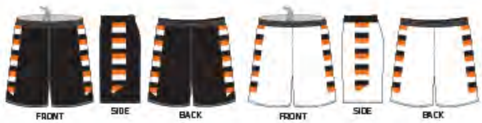
# 12297 - RECTORY BOYS BASKETBALL- SUB 50155, SUB 50148