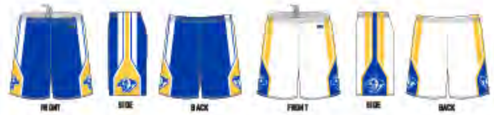
# 13481 - KEARSARGE MS BOYS BASKETBALL - SUB 50155, SUB 50148