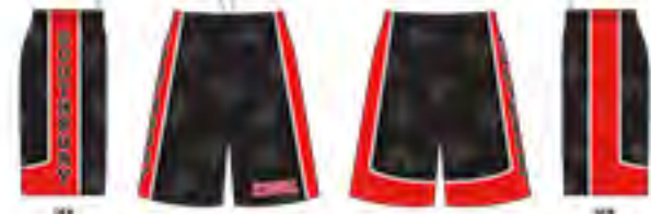
SIDE FRONT BACK SIDE