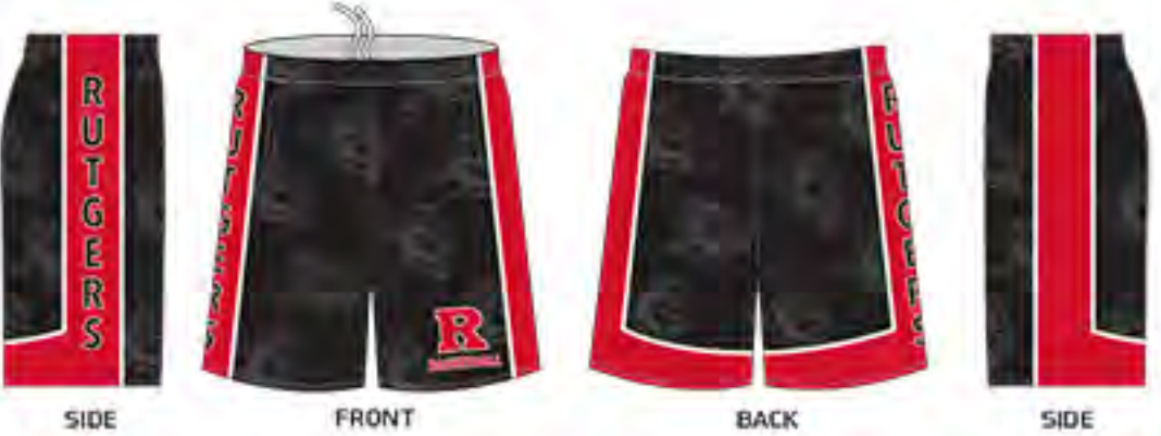
# 2717 - RUTGERS DESIGN 1 - SUB 10132