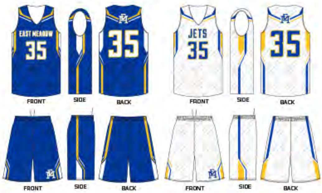
# 3325 - EAST MEADOW BASKETBALL - SUB 10156, SUB 10149