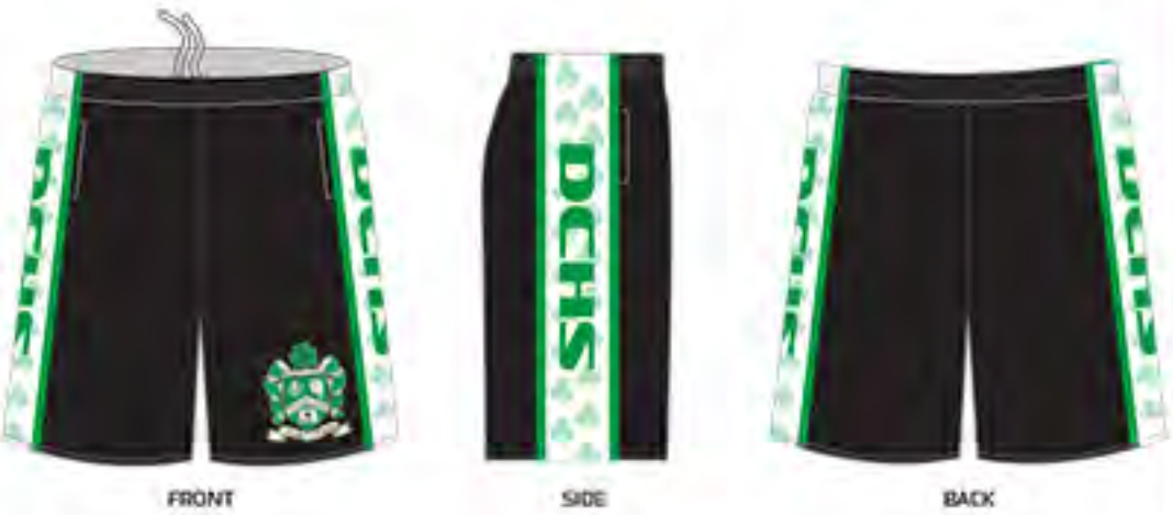
# 2866 - DCHS - SUB 10132