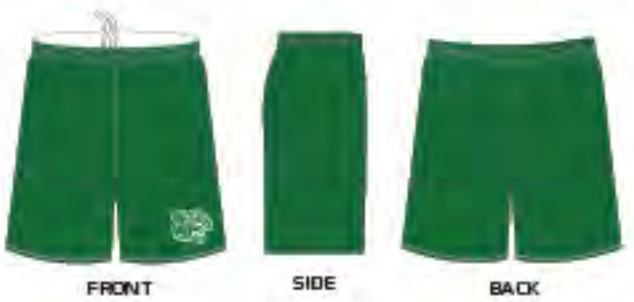
FRONT SIDE BACK