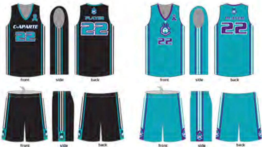
# 2623- CLASS APARTE 2016 - SUB 50155, SUB 10149