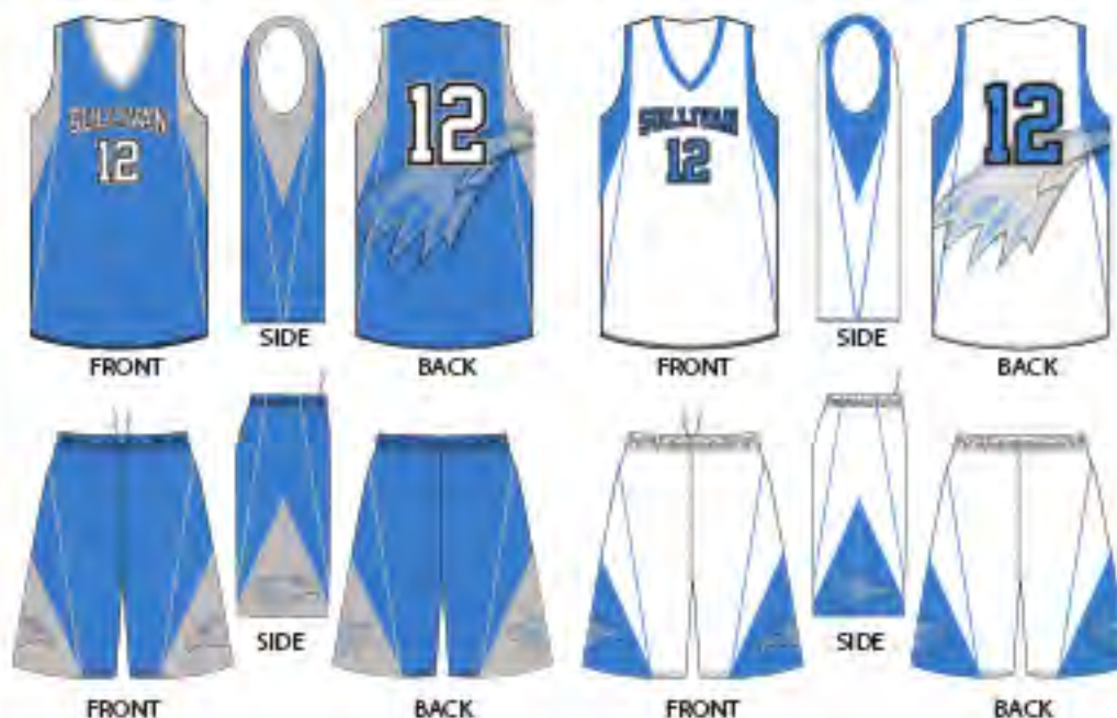
# 249 - SULLIVAN FALCONS BASKETBALL - SUB 50155, SUB 10149