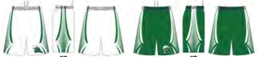
FRONT SIDE BACK FRONT SIDE BACK