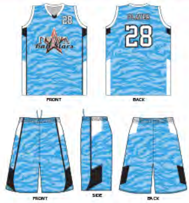
# 5186 - IOWA BALL STARS - SUB 10156, SUB 10149