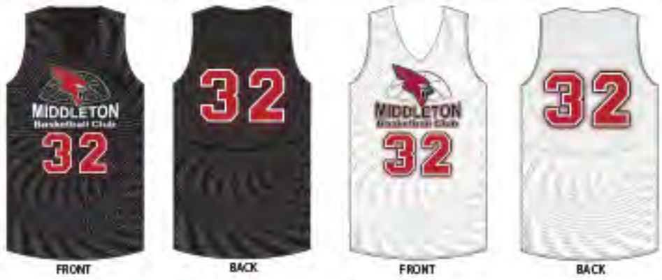
# 275 - MIDDLETON BASKETBALL - SUB 10156, SUB 10149