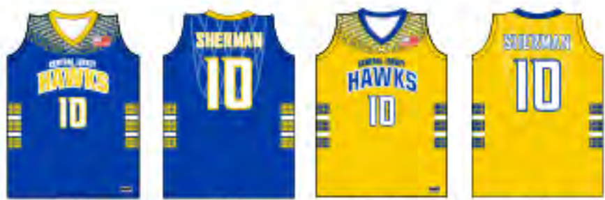
FRONT BACK FRONT BACK