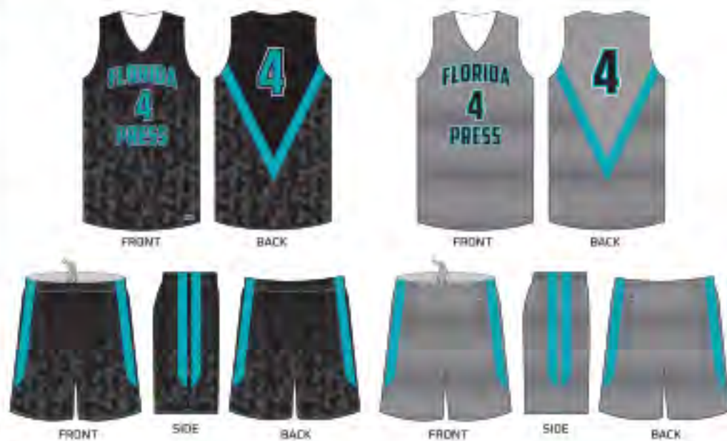
# 3149 - FLORIDA PRESS - SUB 50155, SUB 50149