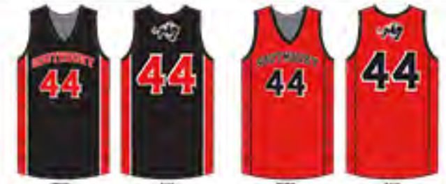
FRONT BACK FRONT BACK