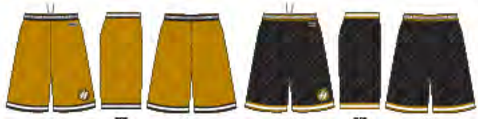
FRONT SIDE BACK FRONT SIDE BACK