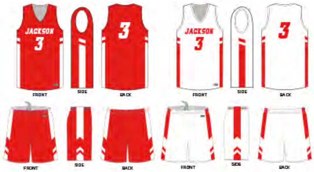
# 4146- JACKSON BASKETBALL - SUB 10156, SUB 10132