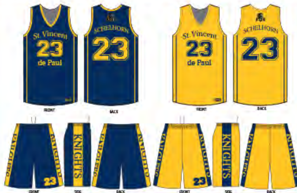
# 844- ST VINCENT DE PAUL BASKETBALL - SUB 50155, SUB 10149