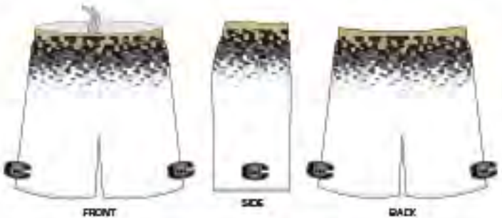
FRONT SIDE BACK