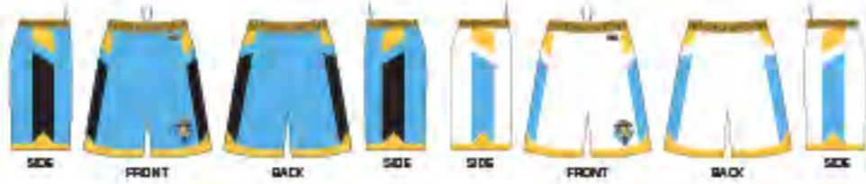
# 12041 - CUMBERLAND BOYS BASKETBALL - SUB 50155, SUB 50148