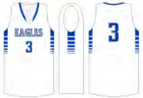
FRONT SIDE BACK