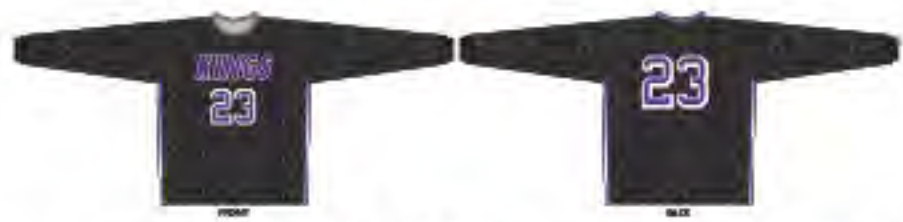
# 4686 - KINGS TEAM 1 - SUB 50155, SUB 10132, SUB 10187