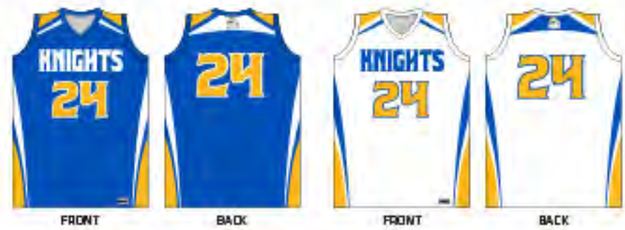
FRONT BACK FRONT BACK