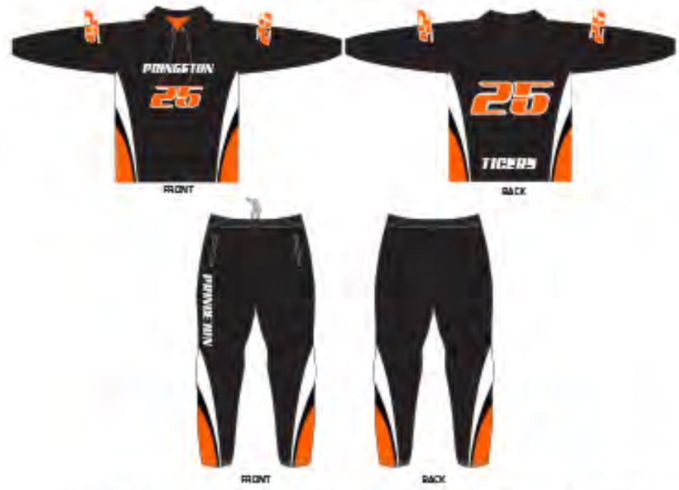
# 4108 - PRINCETON BASKETBALL - SUB 80194, SUB 80126