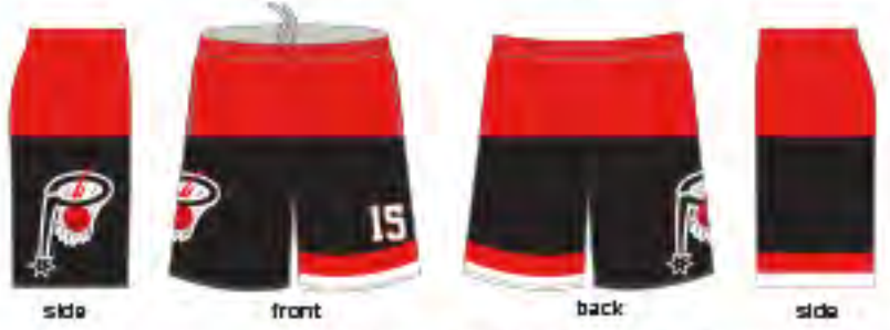
# 786 - PARVULOS- SUB 10156, SUB 10132