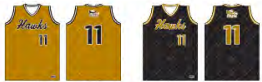
FRONT BACK FRONT BACK