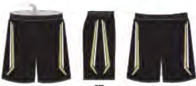
FRONT SIDE BACK