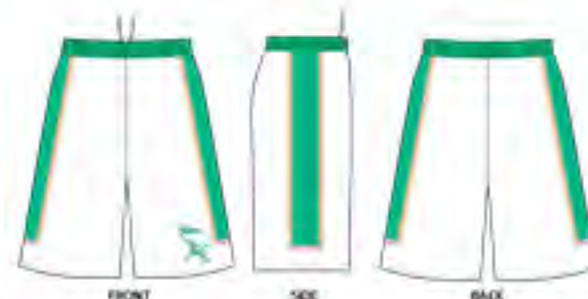
# 2880 - CLINTON BASKETBALL - SUB 10156, SUB 10149