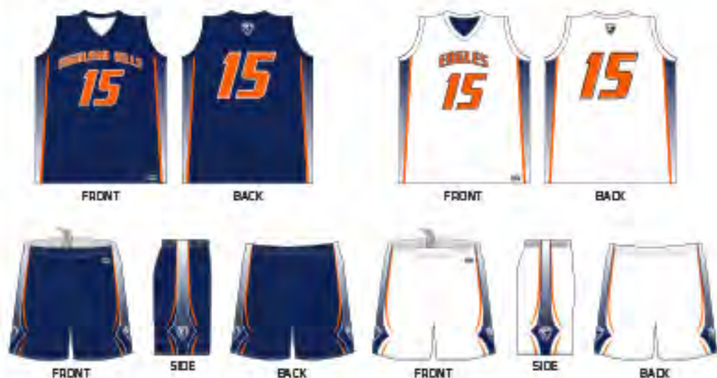
# 5106 - EAGLES - SUB 50155, SUB 50132