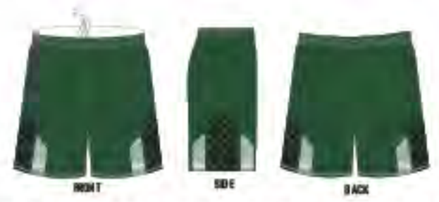
# 15389 - LACROSSE TIGERS BASKETBALL - SUB 10155, SUB 10130