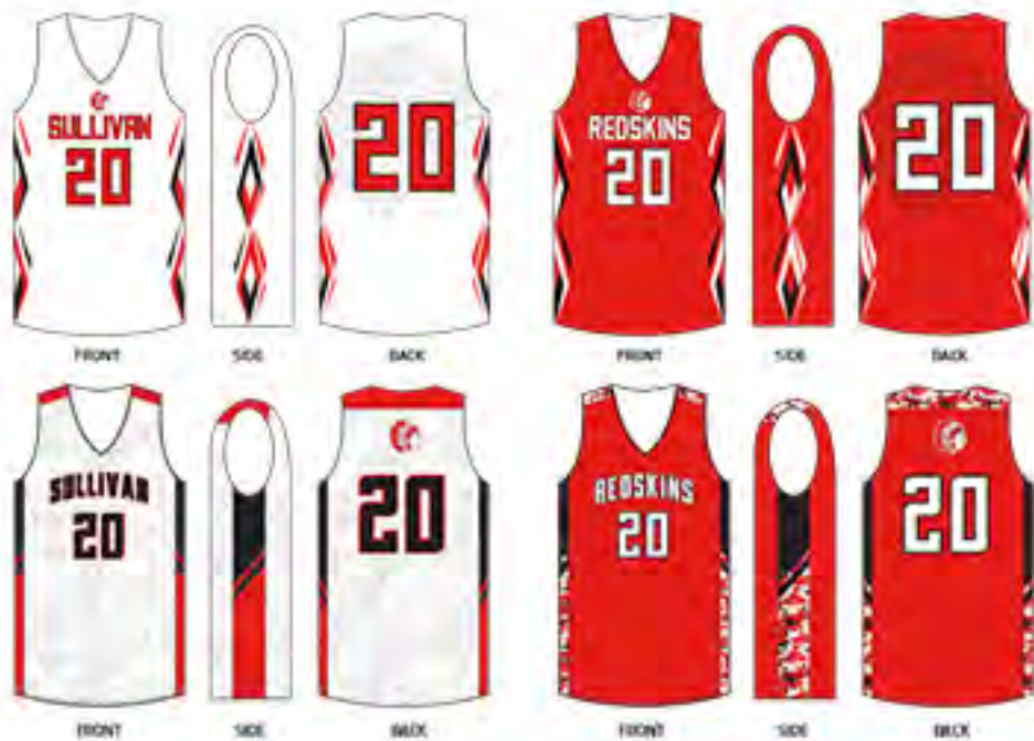
# 2849 - SULLIVAN REDSKINS - SUB 50155