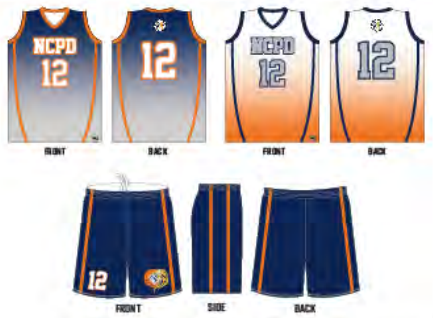
# 13097 - NCPD LIONS BASKETBALL - SUB 50155, SUB 10132