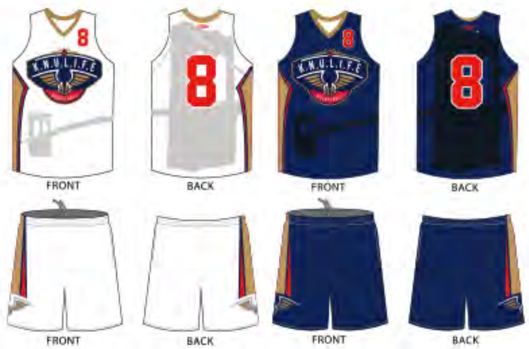
KNU LIFE- SUB 10156, SUB 10132