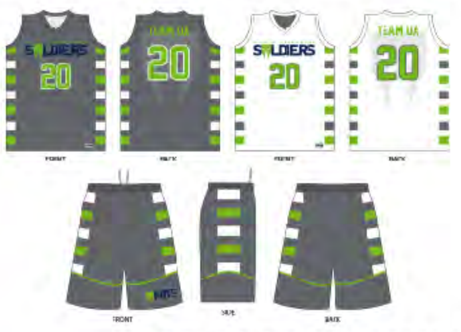
# 10990 - MTS BASKETBALL - SUB 50155, SUB 50130