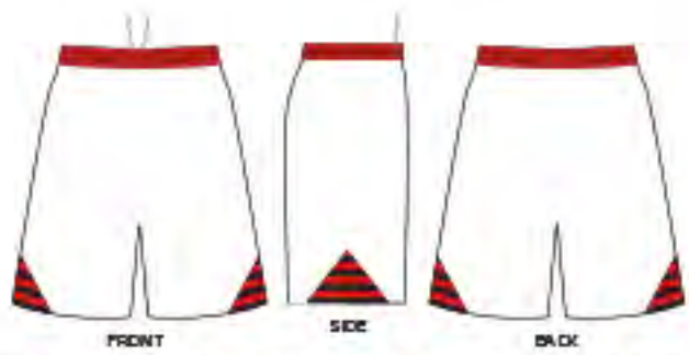
# 5284 - THROWBACK KLIPPERS - SUB 10156, SUB 10149