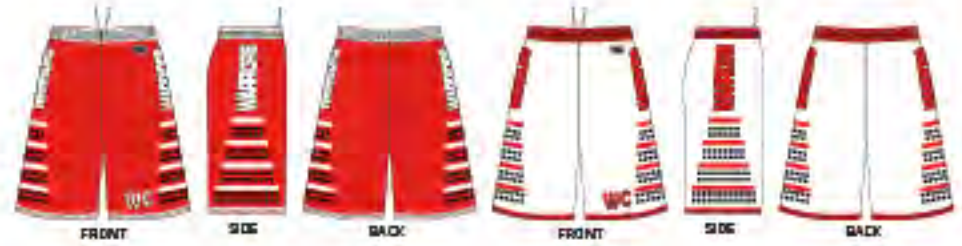
# 11955 - WARREN CENTRAL BASKETBALL - SUB 50156, SUB 50148