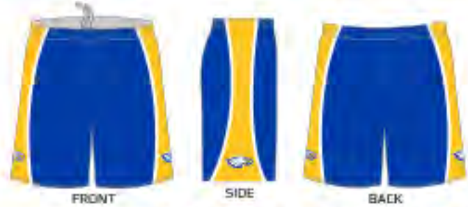
FRONT SIDE BACK