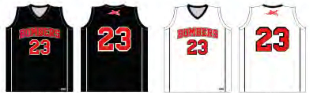
FRONT BACK FRONT BACK