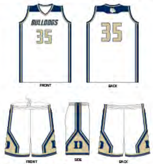
# 12354 - DORA HS BASKETBALL #1 - SUB 10156, SUB 10148