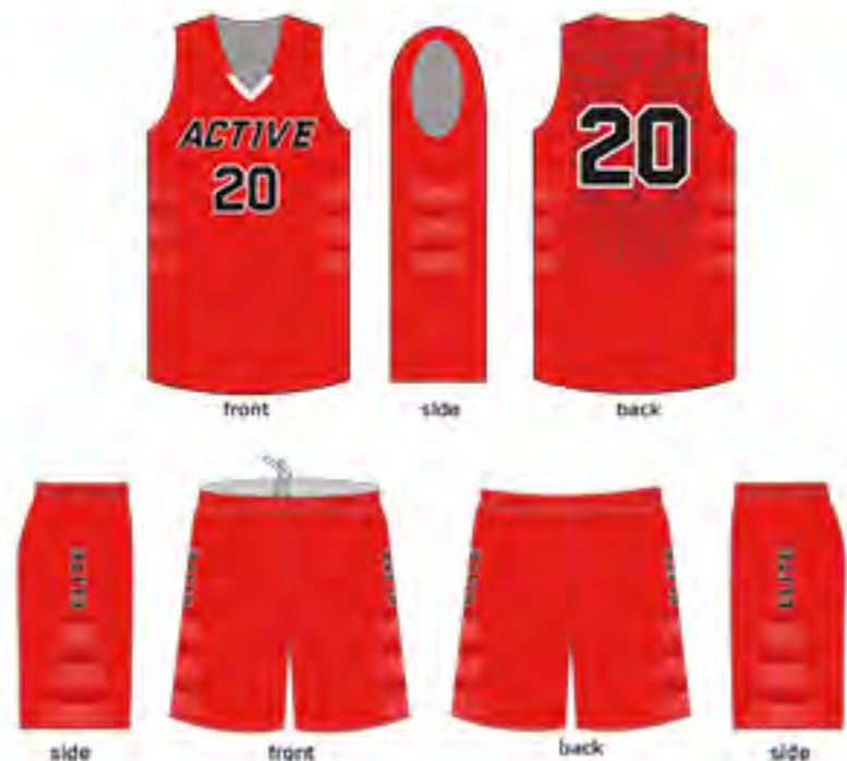
# 2205 - ACTIVE RED - SUB 10156, SUB 10132