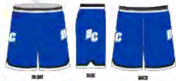
# 16090 - LANCERS BASKETBALL UNIFORM - SUB 10156, SUB 10132