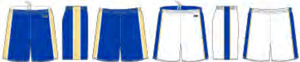
FRONT SIDE BACK FRONT SIDE BACK