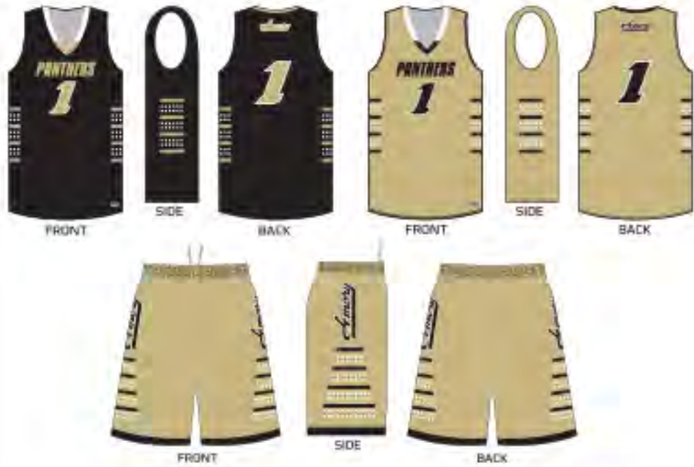
# 3409 - AMORY PRACTICE - SUB 50155, SUB 10132