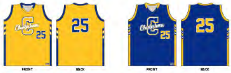
# 4789 - CHARLESTOWN - SUB 50155, SUB 50132