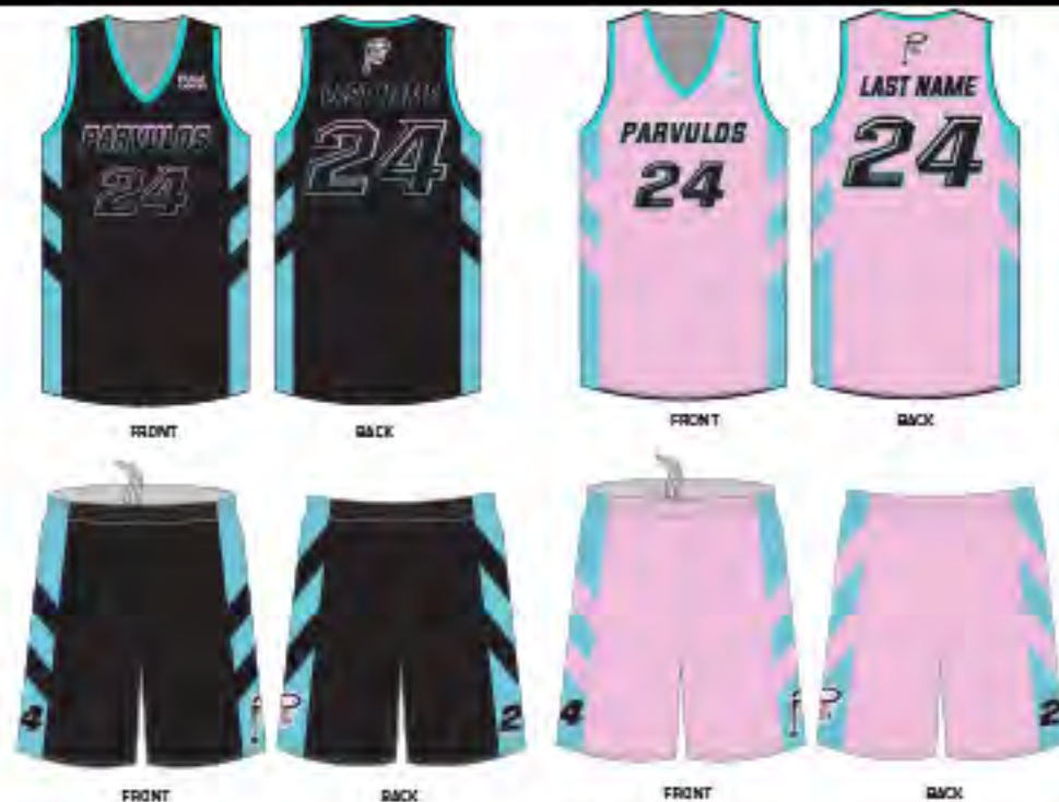
# 2700 - PARVULOS - SUB 50155, SUB 50149