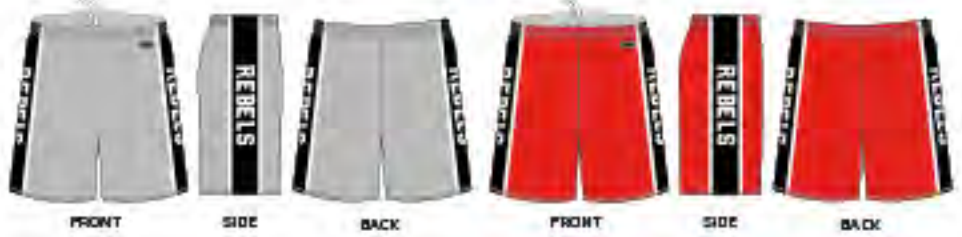
# 11942 - SOUTH NEWTON BASKETBALL - SUB 50155, SUB 50148