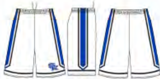
FRONT SIDE BACK