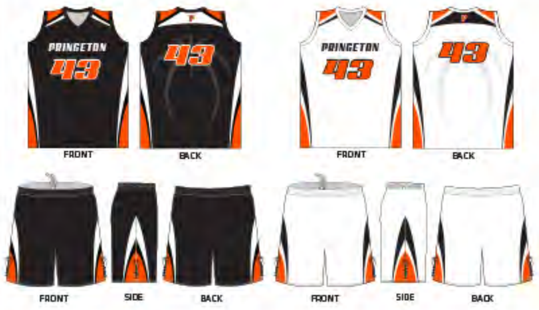
# 4856 - PRINCETON BASKETBALL - SUB 10156, SUB 10132