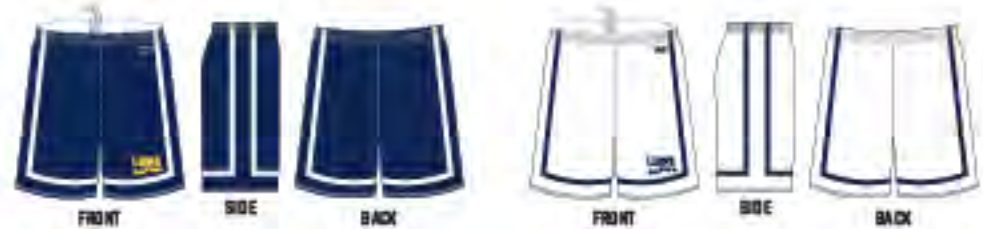
# 13963 - LINDENWOLD BOYS BASKETBALL - SUB 50155, SUB 50148