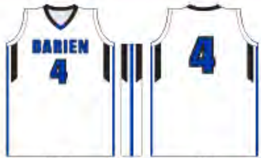
FRONT SIDE BACK