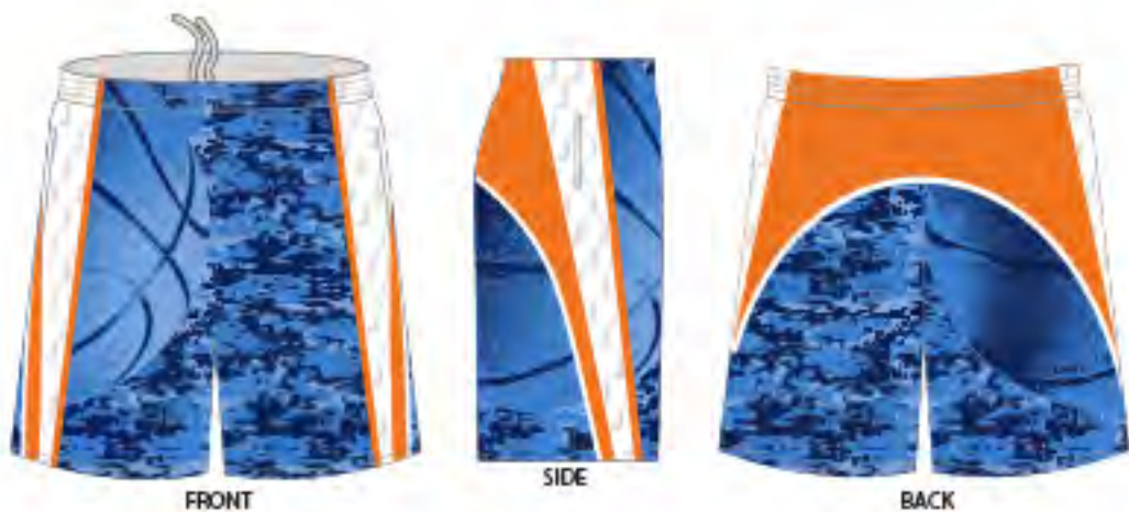
# 471 - ROTHMAN - SUB 10132