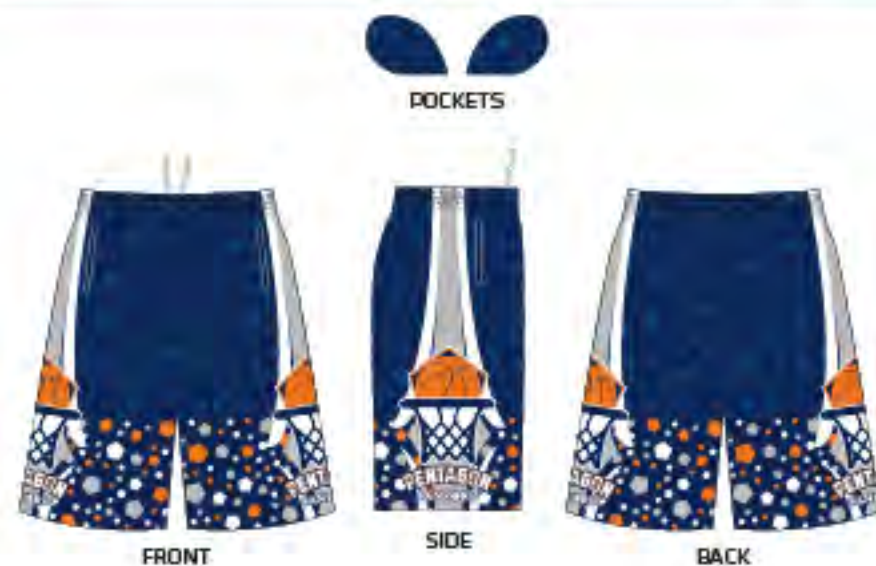
# 11428 - PENTAGON BASKETBALL SHORTS - SUB 10148