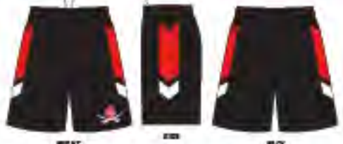
FRONT SIDE BACK