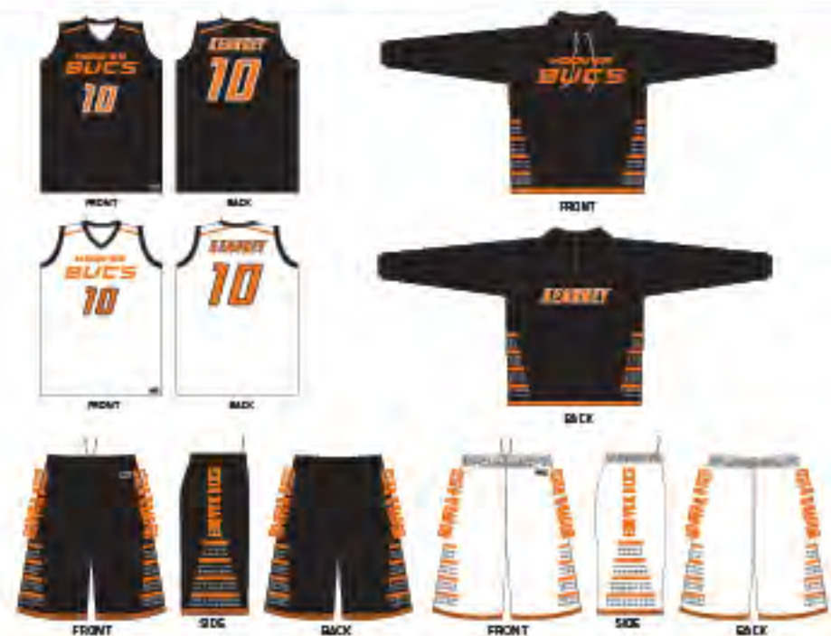
# 12345 - HOOVER BUCS BASKETBALL - SUB 50155, SUB 50130, SUB 10125