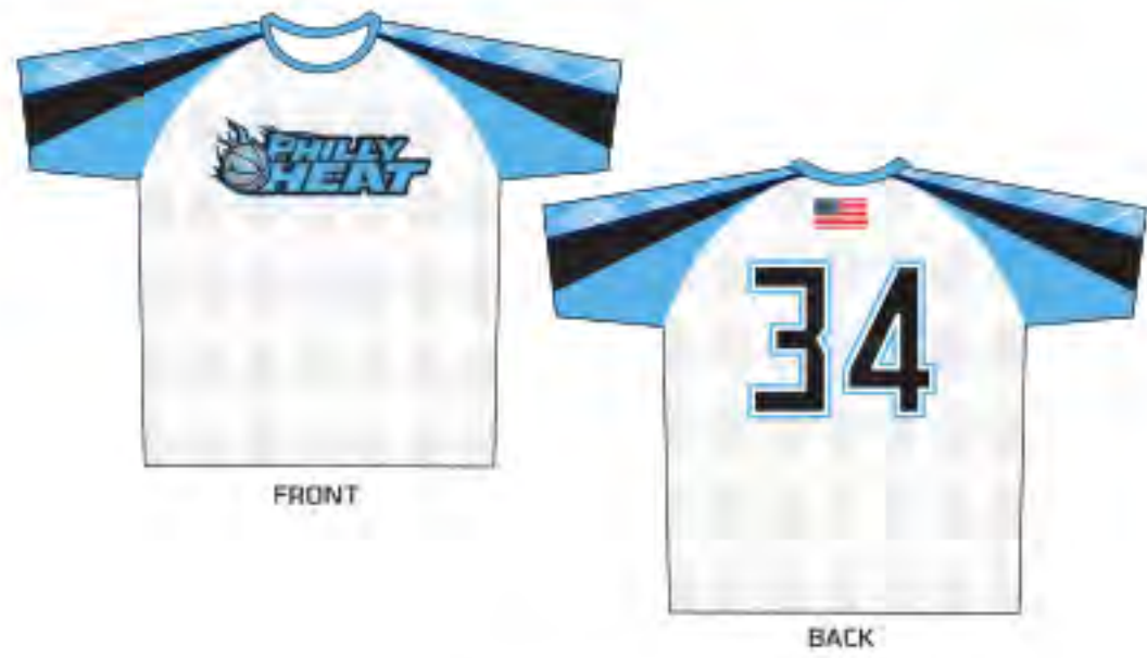
# 3266 - PHILLY HEAT - SUB 10107