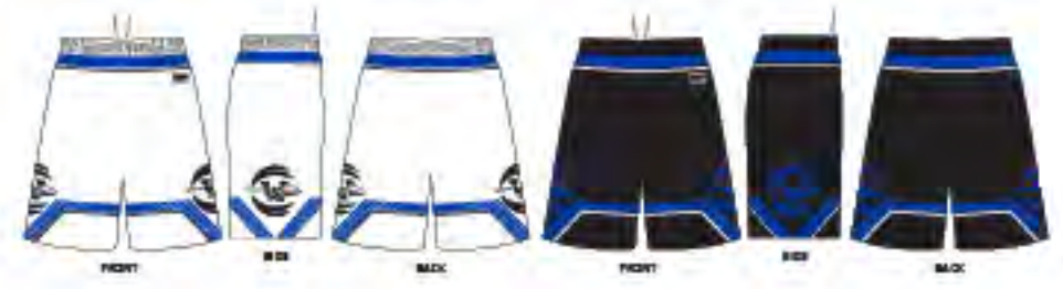
# 12318 - WARRIORS BASKETBALL - SUB 50155, SUB 50132