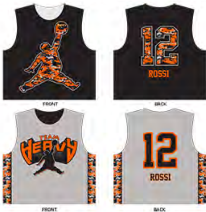
# 2076 - TEAM HEAVY - SUB 50151