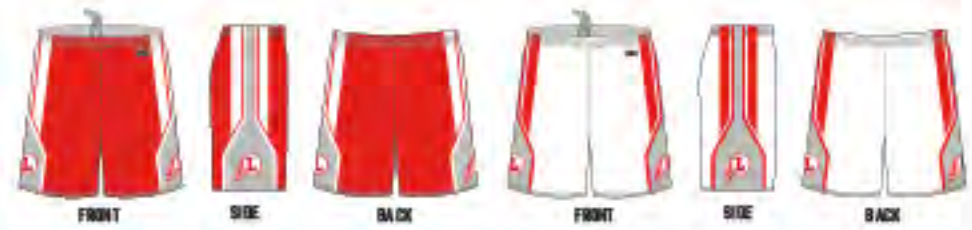
# 15953 - OXBRIDGE BASKETBALL - SUB 50155, SUB 50148