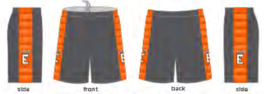
# 801 - EASTON BASKETBALL - SUB 10156, SUB 10149