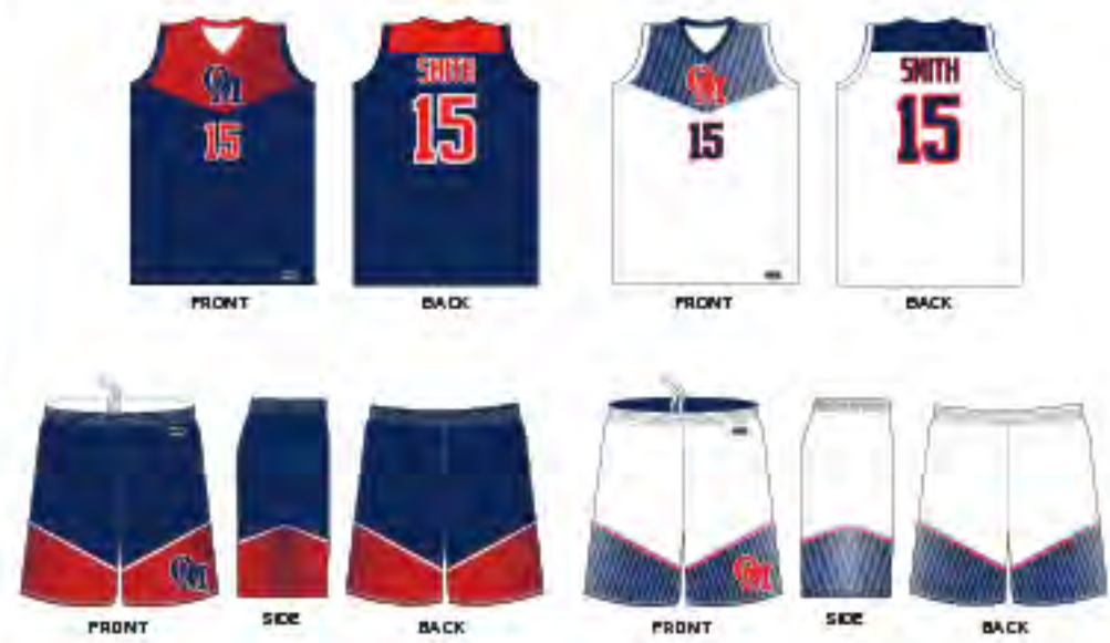
# 12367 - OM BASKETBALL - SUB 50155, SUB 50130