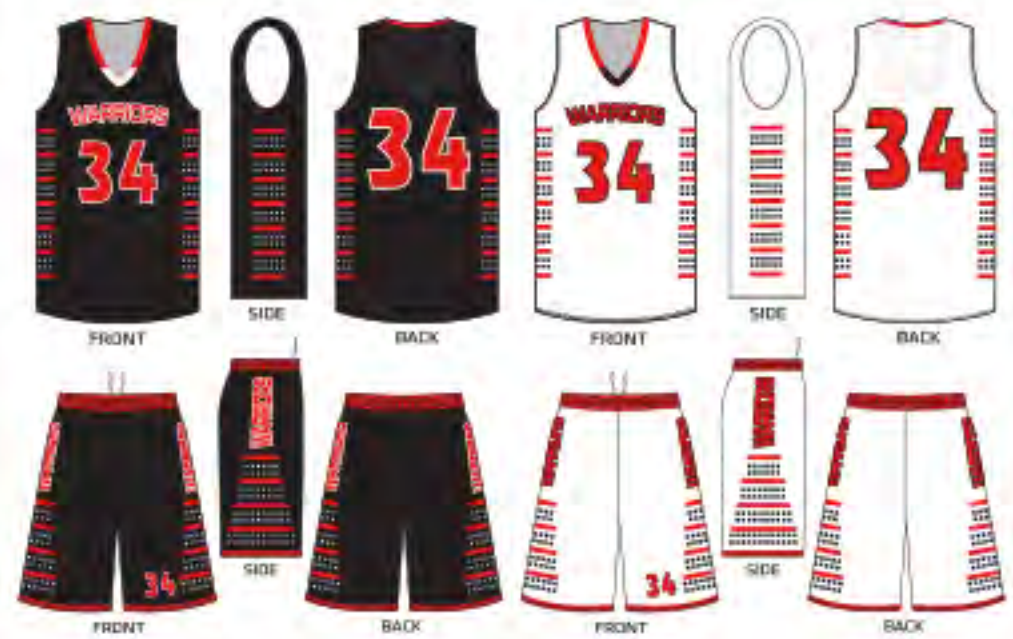
# 3240 - WARRIORS BASKETBALL - SUB 50155, SUB 50132