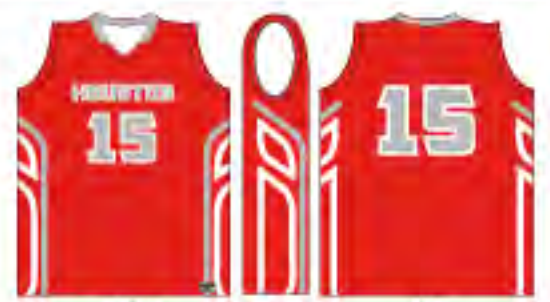
FRONT SIDE BACK