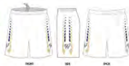
# 2870 - WHITEFIELD - SUB 10156, SUB 10132