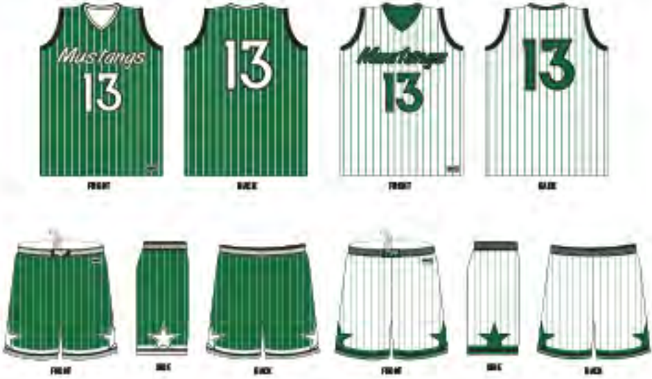
# 12894 - MUSTANGS BASKETBALL - SUB 50155, SUB 50148