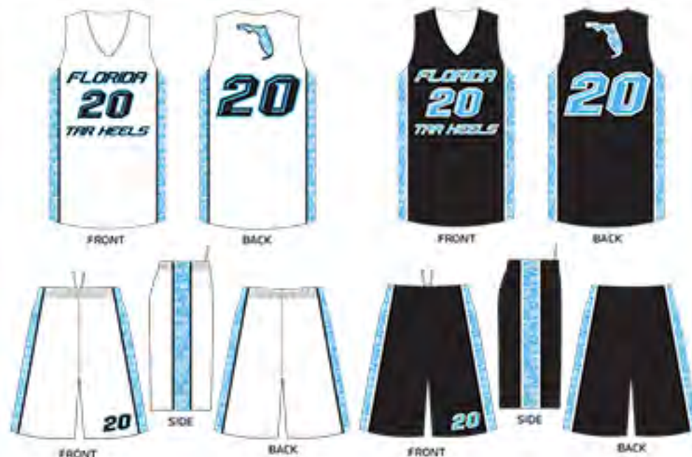
# 2092 - FLORIDA - SUB 50155, SUB 50149